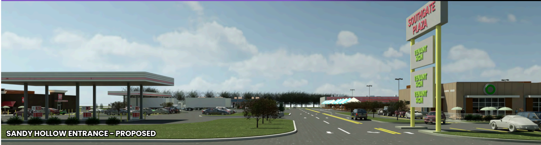
SANDY HOLLOW ENTRANCE - PROPOSED