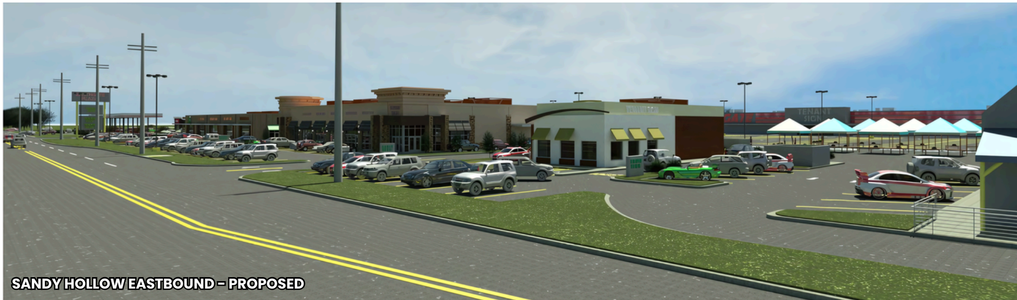
SANDY HOLLOW EASTBOUND - PROPOSED