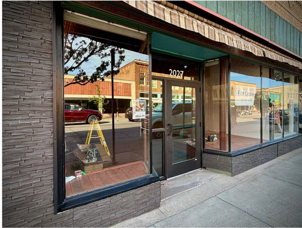
Building Photo 3