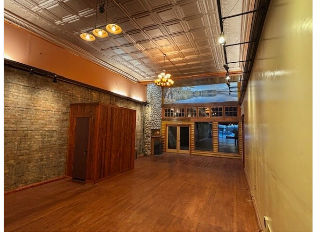
main space back