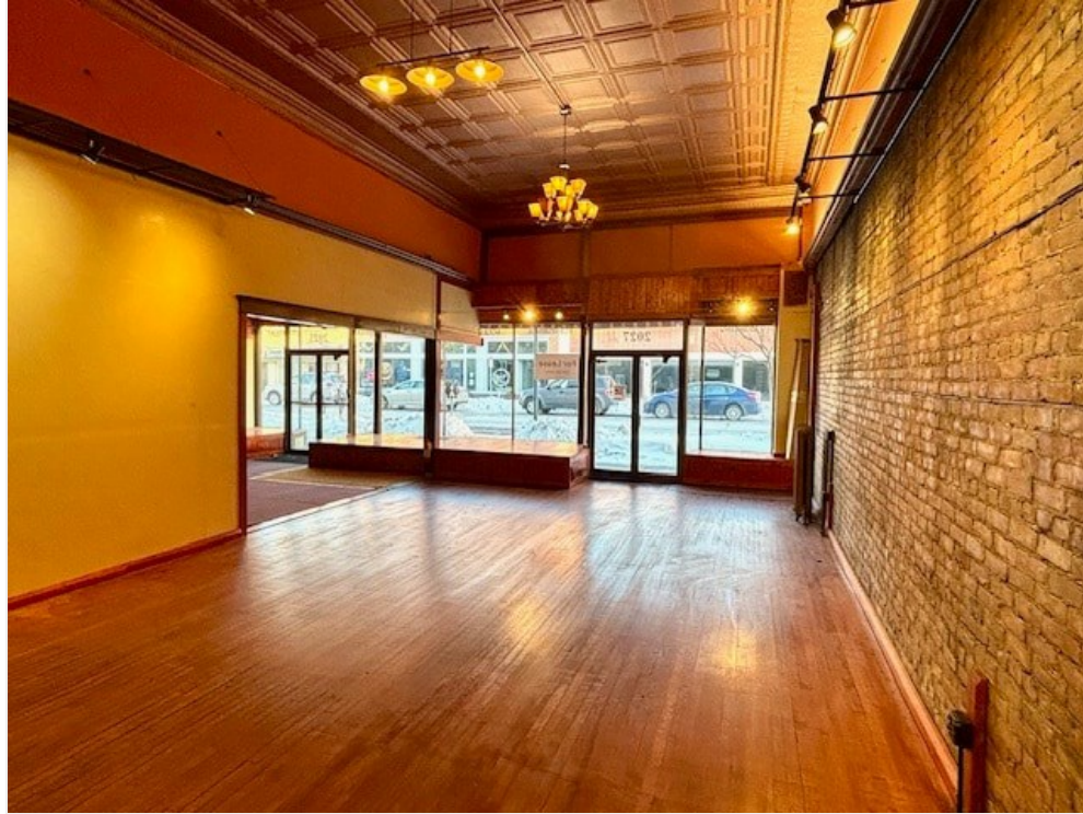
main space towards street