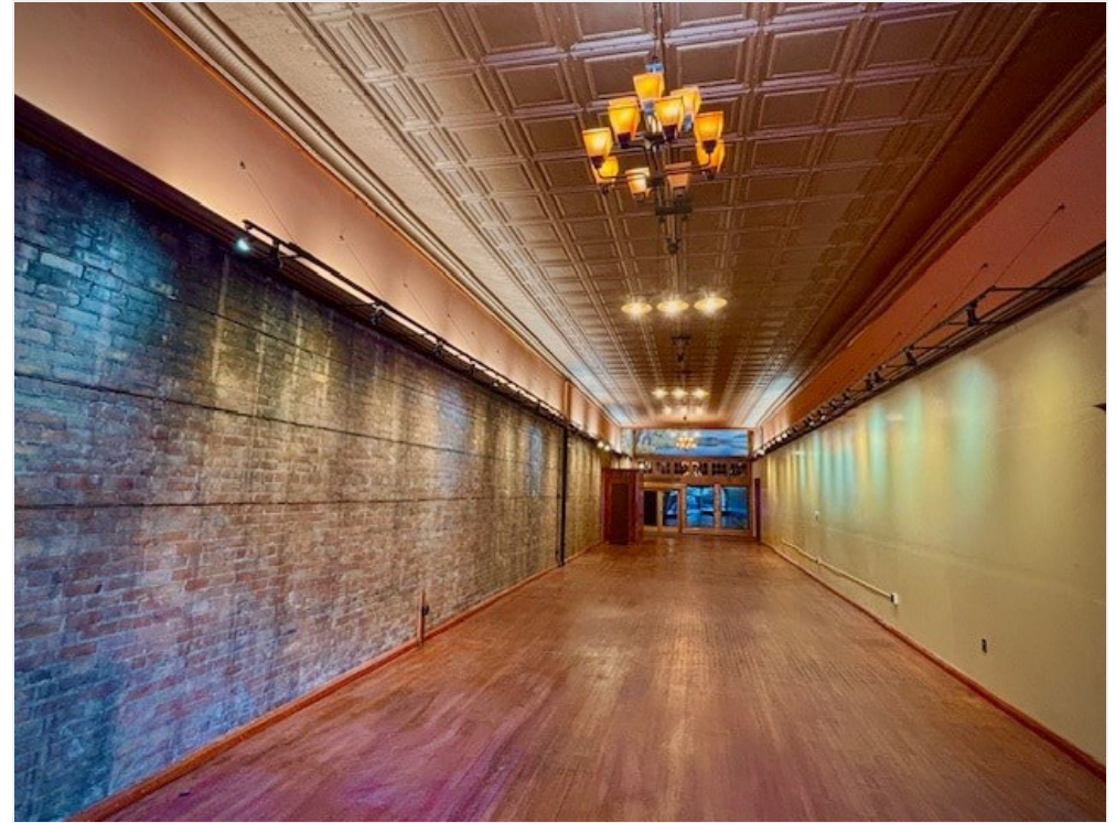
interior main space