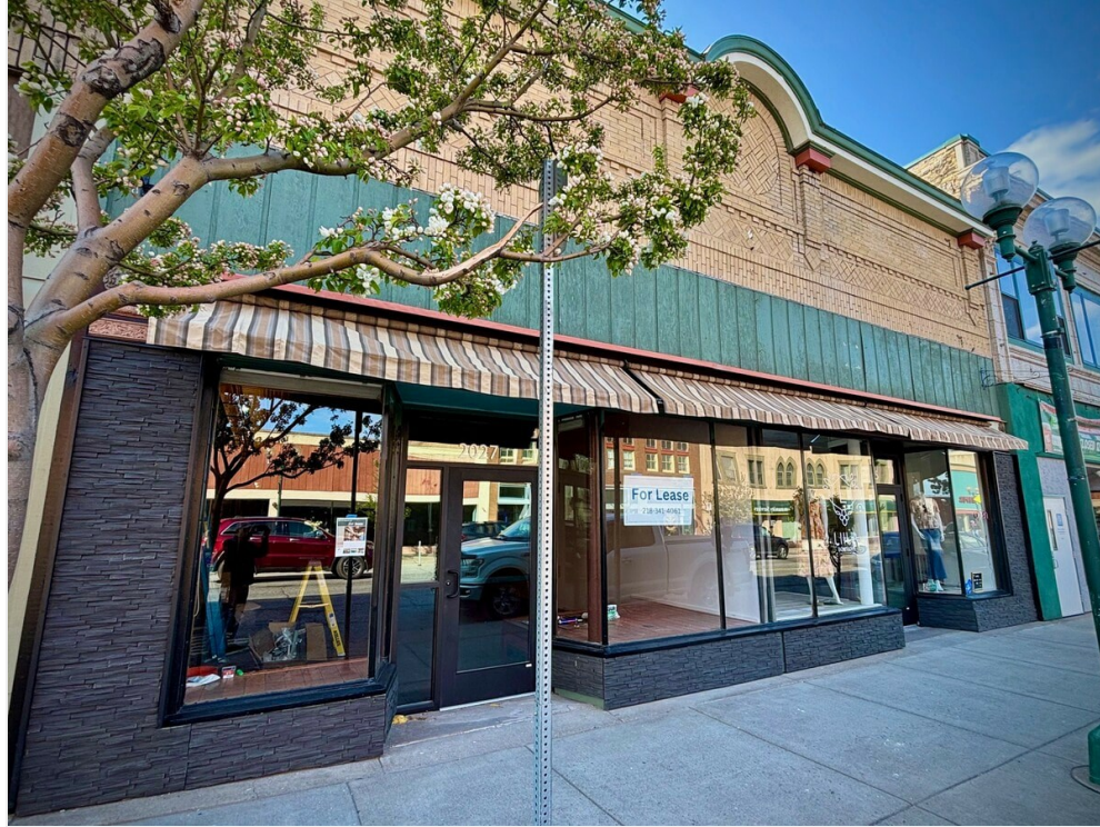
Building Photo 1