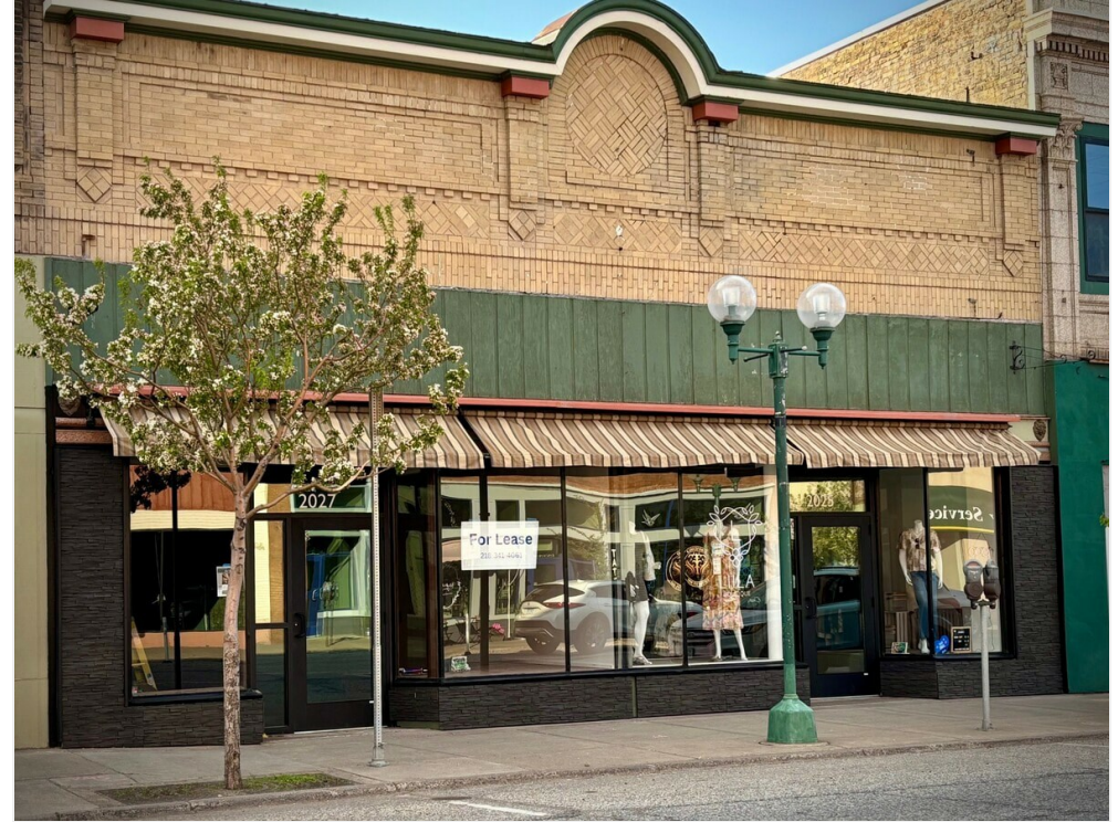
Building Photo 2