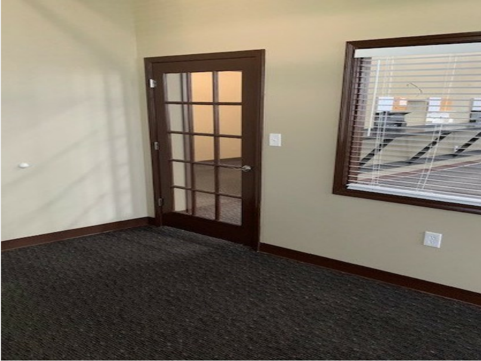
Sixes Suite 201 IMG_0776