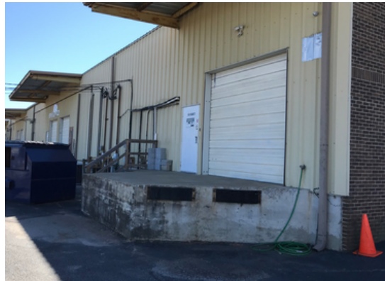
GREENVILLE COUNTY TAX MAP #0533030105100