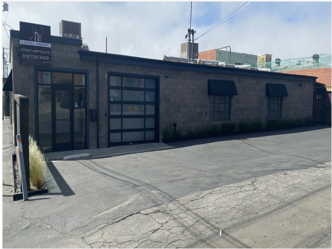
607 Main Entrance JPG

601-607 E El Segundo Blvd, El Segundo, CA 90245