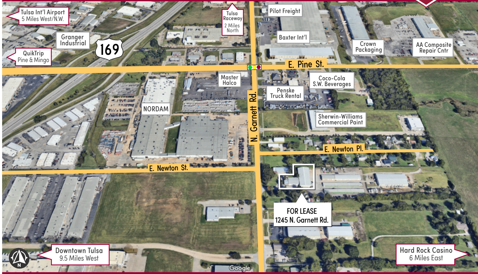
Greater Tulsa Area Map