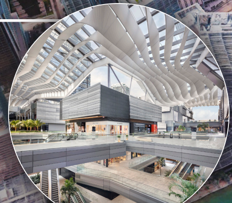
Brickell City Centre