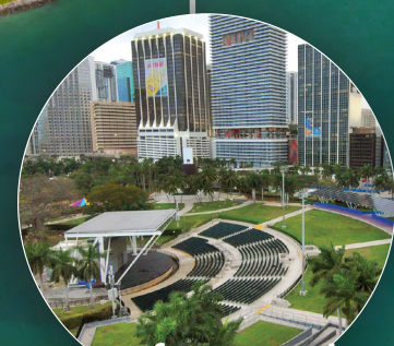
Bayfront Park Amphitheater