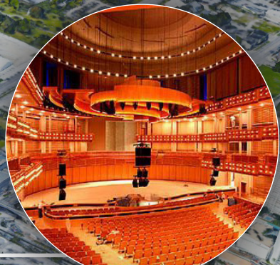
Adrienne Arsht Center