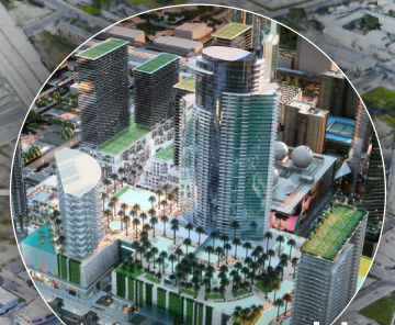
Miami World Center