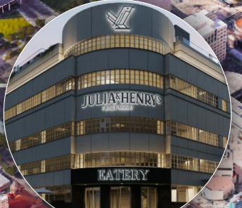
Julia & Henry's