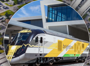
Miami Central/ Brightline Station