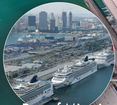
Port of Miami