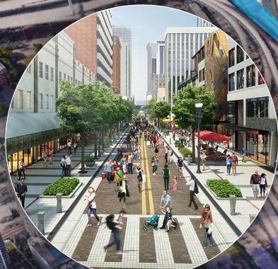
Flagler Street Beautification