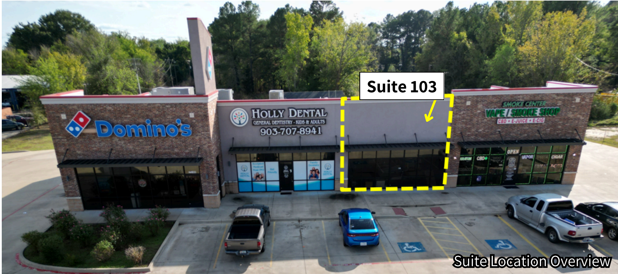
Suite Location Overview