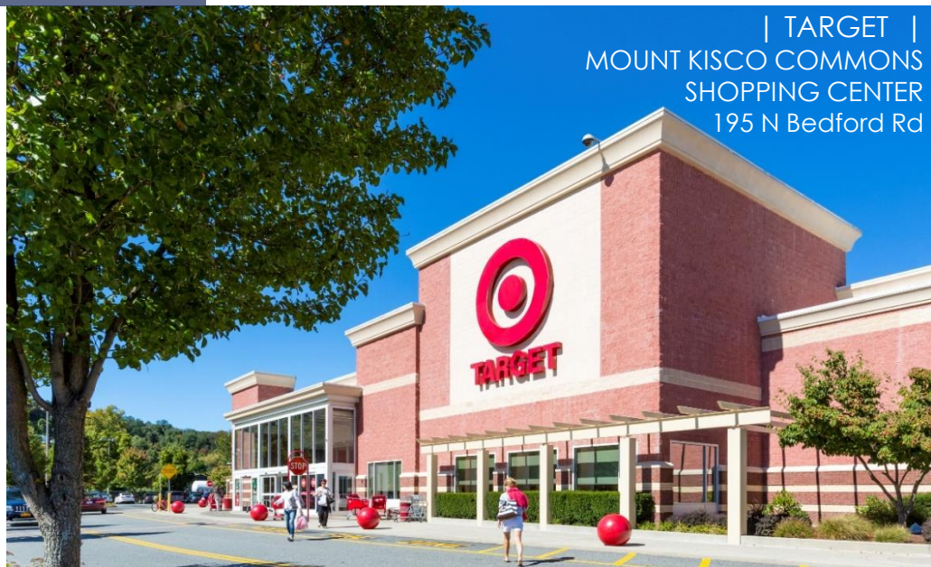
| TARGET | MOUNT KISCO COMMONS SHOPPING CENTER 195 N Bedford Rd

DUE TO ITS EXCELLENT ACCESSIBILITY AND CENTRAL LOCATION, THE MOUNT KISCO / BEDFORD HILLS AREA IS A MAJOR SHOPPING DESTINATION WITHIN NORTHERN WESTCHESTER.