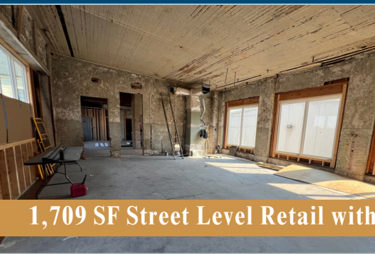
1,709 SF Street Level Retail with Newly Updated Exterior