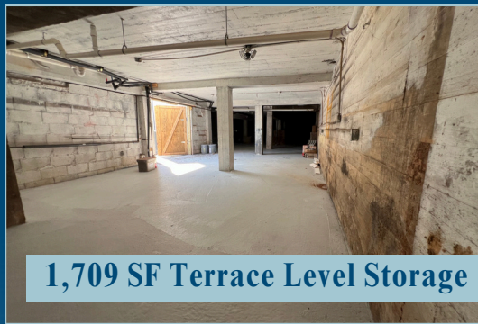
1,709 SF Terrace Level Storage