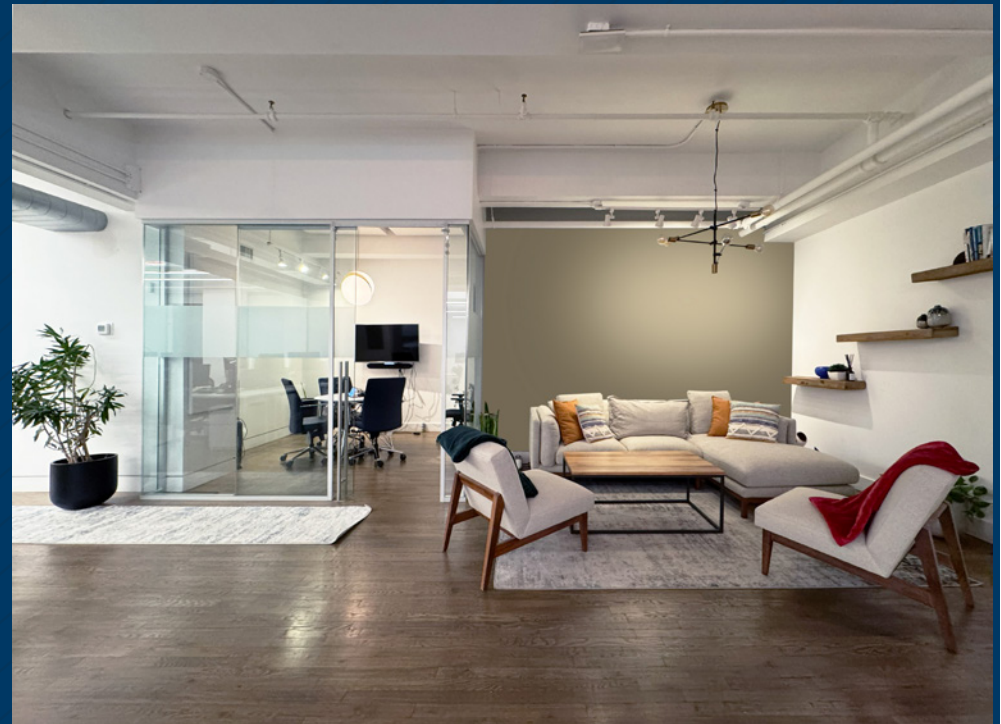
Furniture shown for layout concept only

ABS Partners Real Estate, as the exclusive agent is pleased to offer the following opportunity for lease: