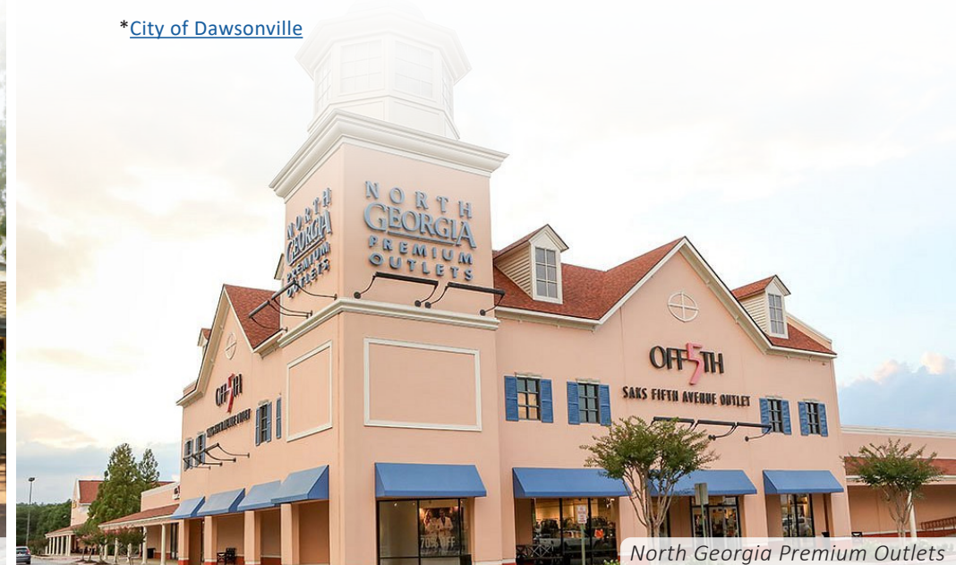
North Georgia Premium Outlets