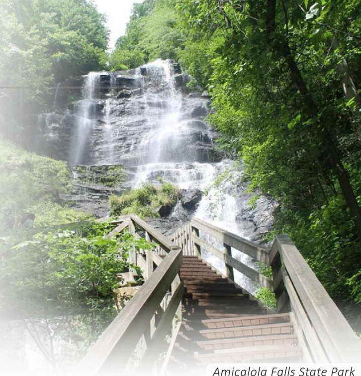
Amicalola Falls State Park

Dawsonville continues to put out the “welcome mat” for locals and tourists and hosts a number of festivals and events, including The Mountain Moonshine Festival the 4th weekend in October. The Dawsonville town square comes alive with plays, clogging, and other entertainment.