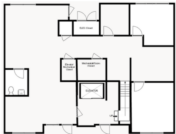
First Floor Layout