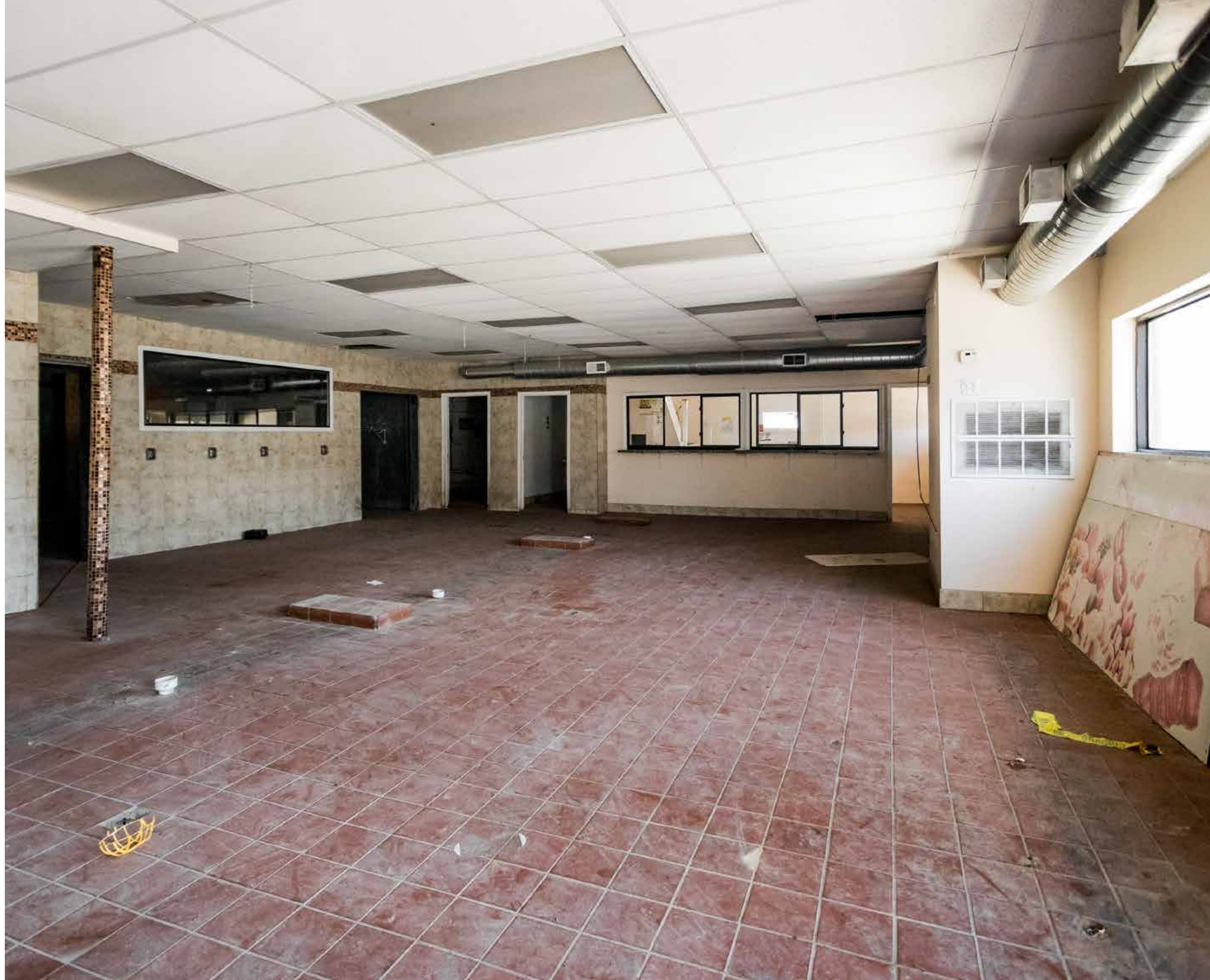
OPEN SPACES READY FOR REDEVELOPMENT