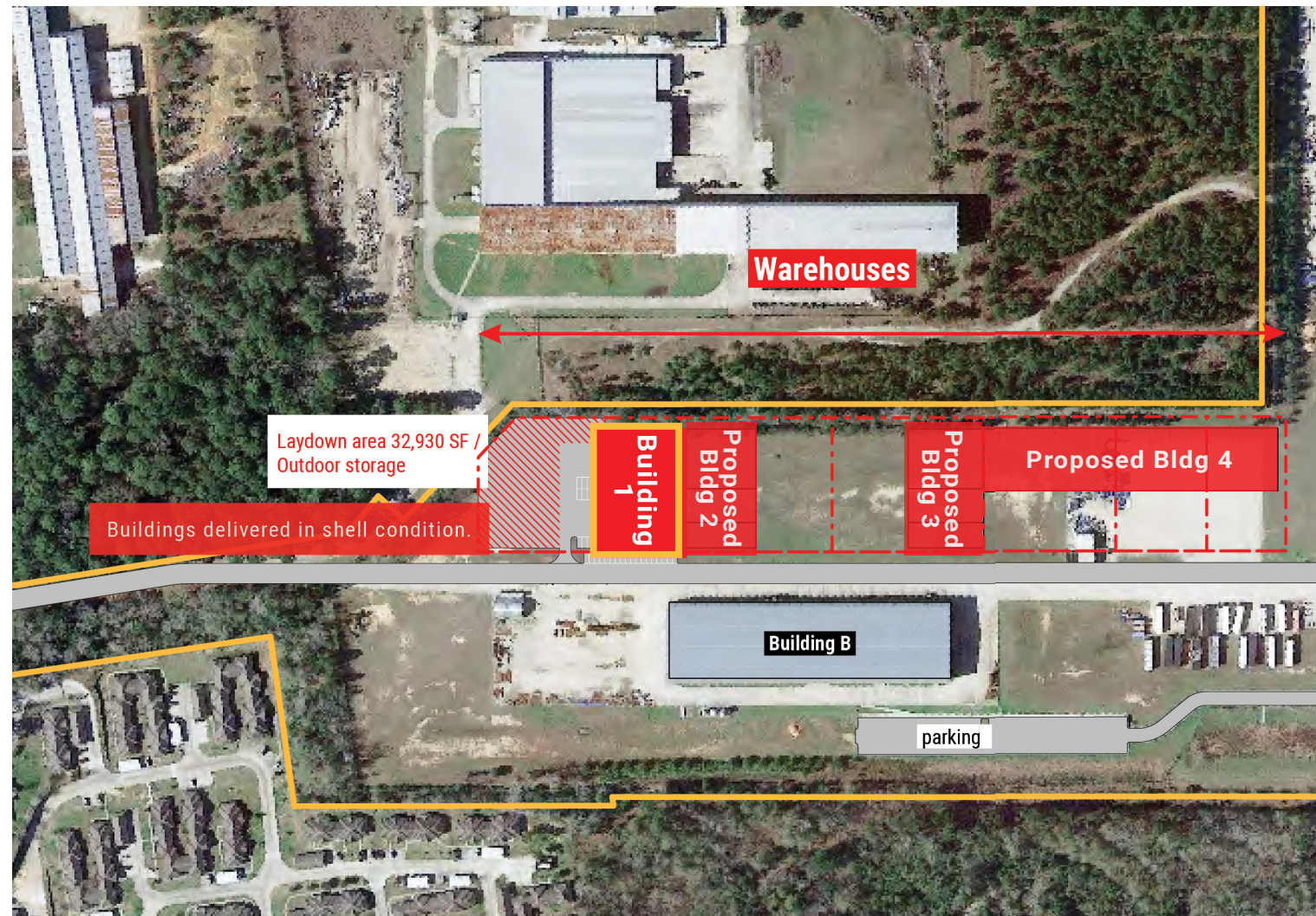
Hypothetical demising plan