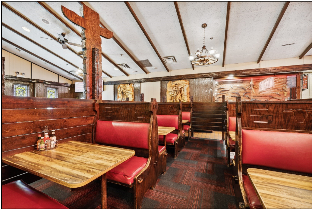
Front Dining Area #1