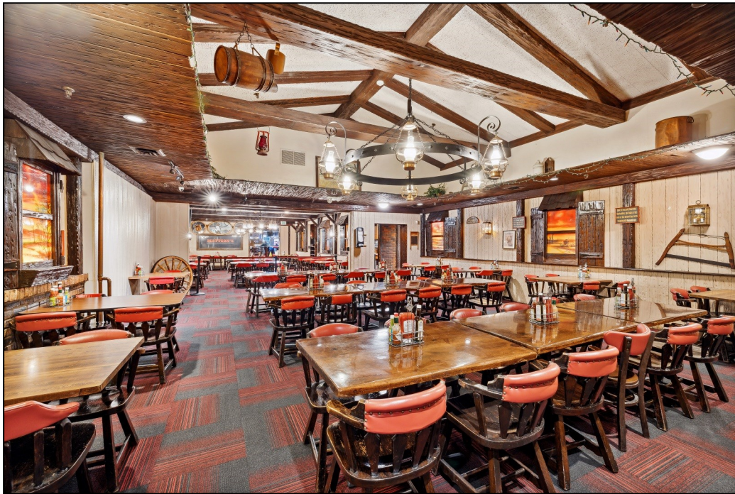
Dining Area #3