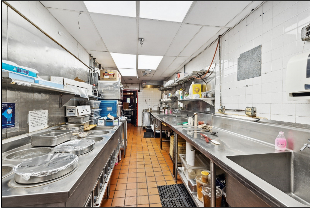
Kitchen Prep Area