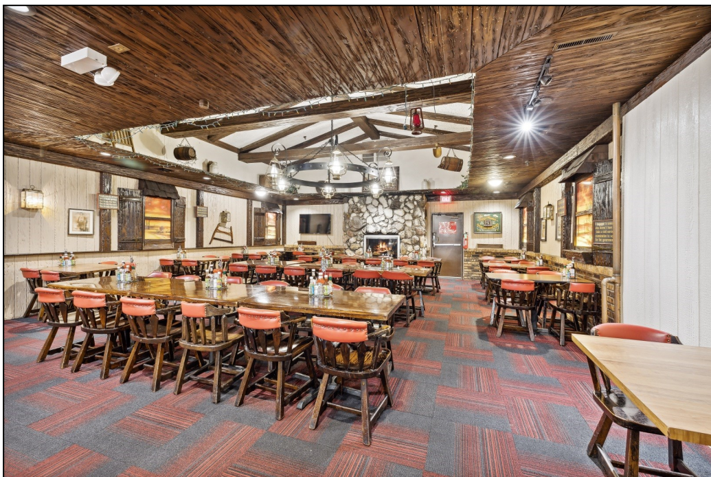
Dining Area #4 (Fireplace)