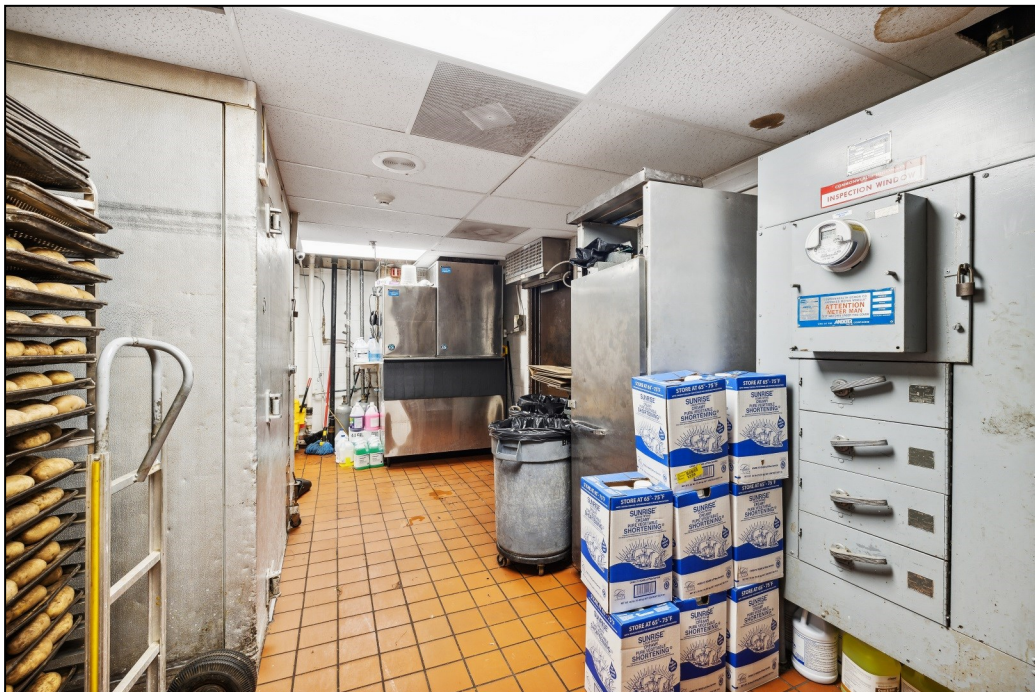
Walk in Cooler/ Freezer