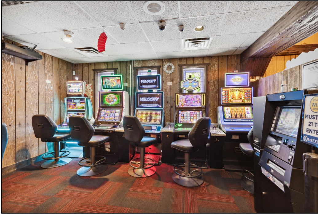
Video Gaming Area