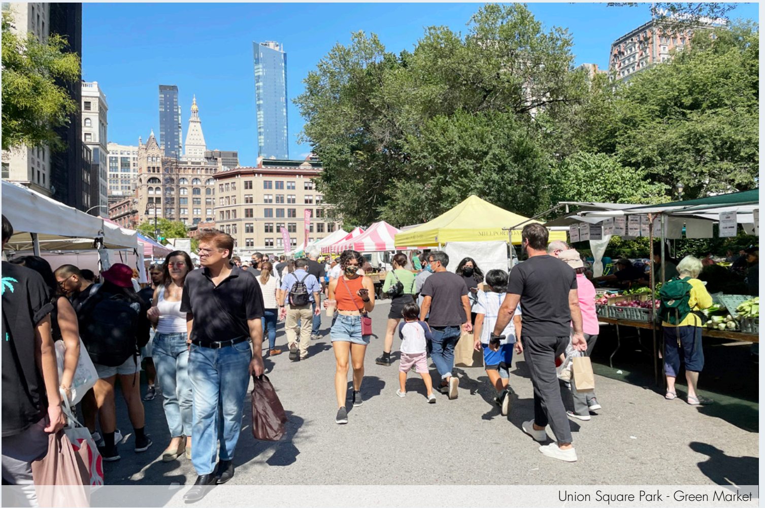
Union Square Park - Green Market