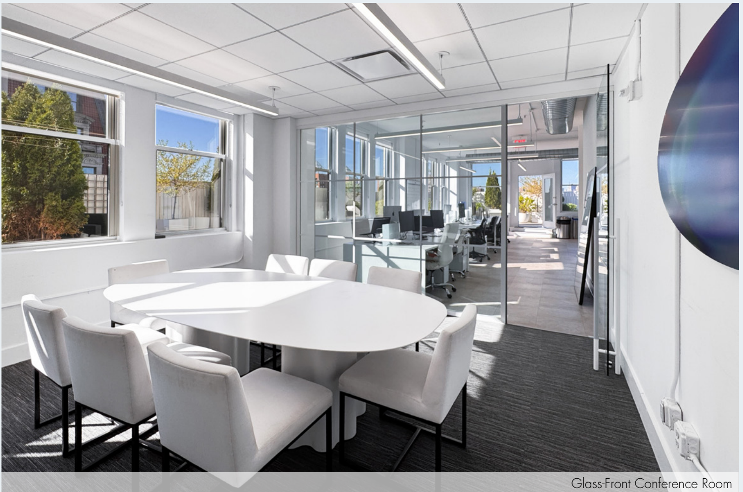
Glass-Front Conference Room

Furniture shown for layout concept only.)