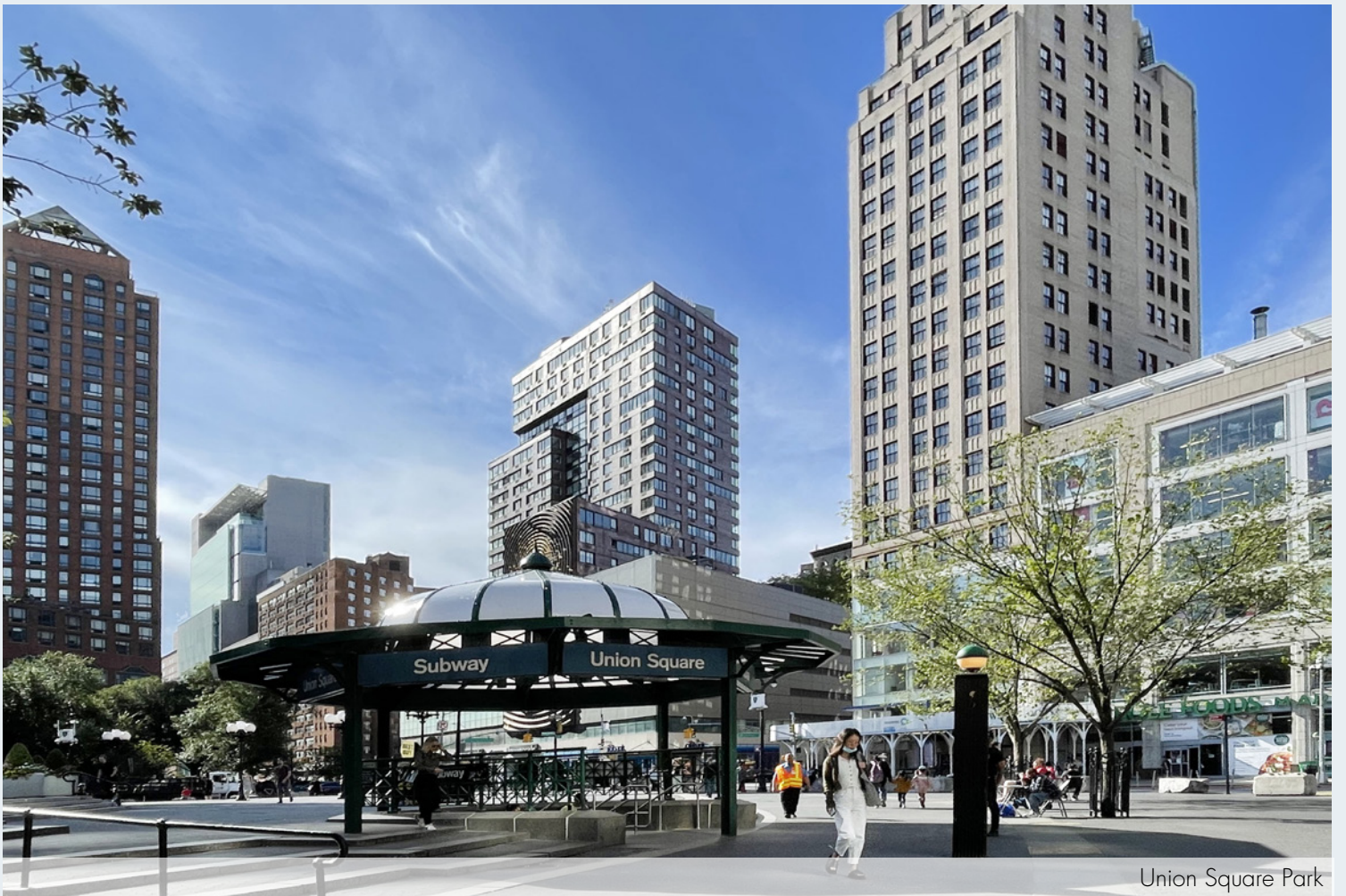
Union Square Park