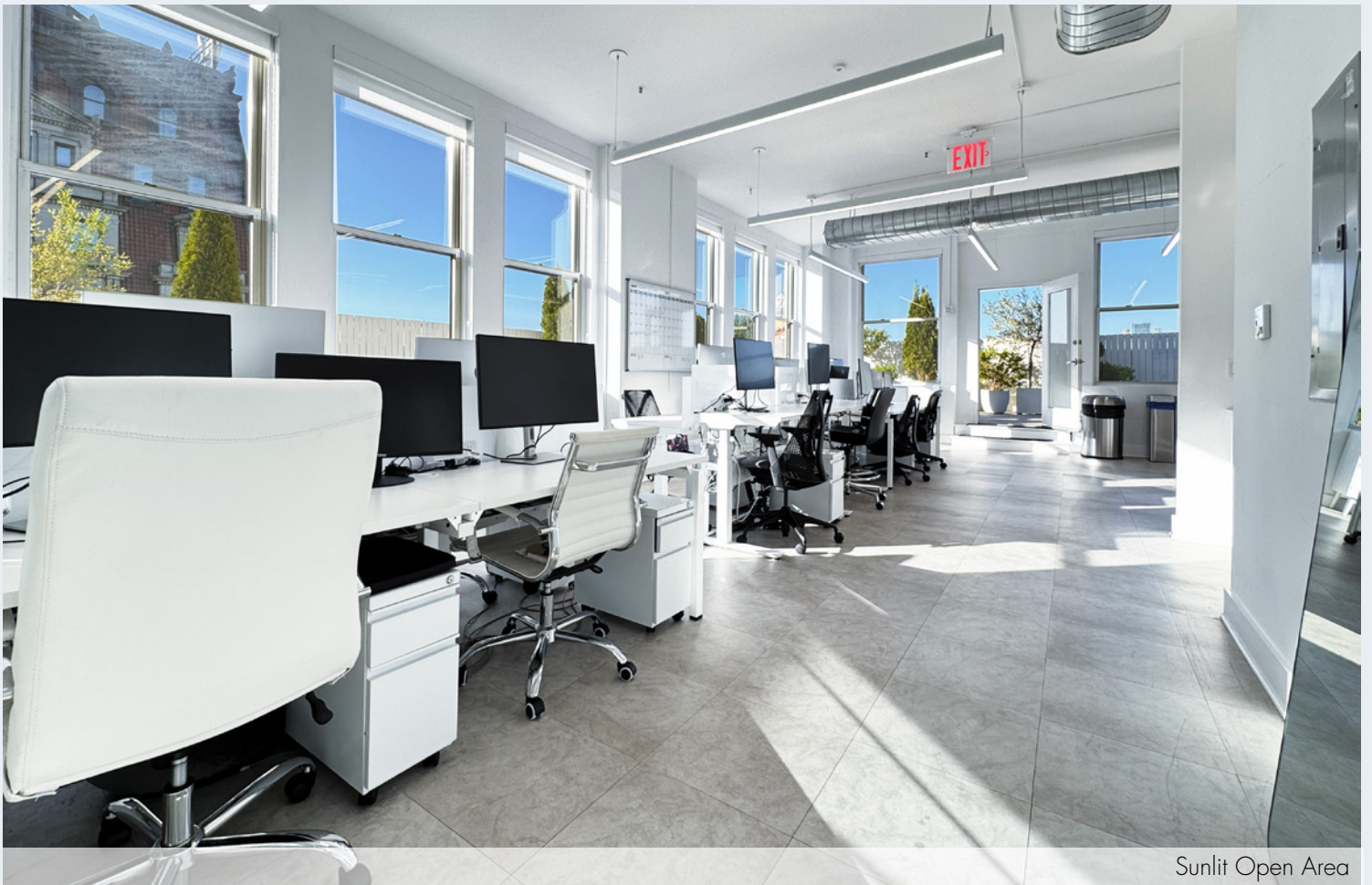
Sunlit Open Area