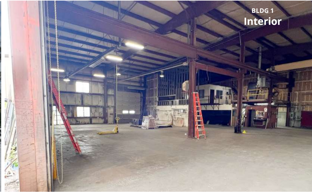
BLDG 1 Interior