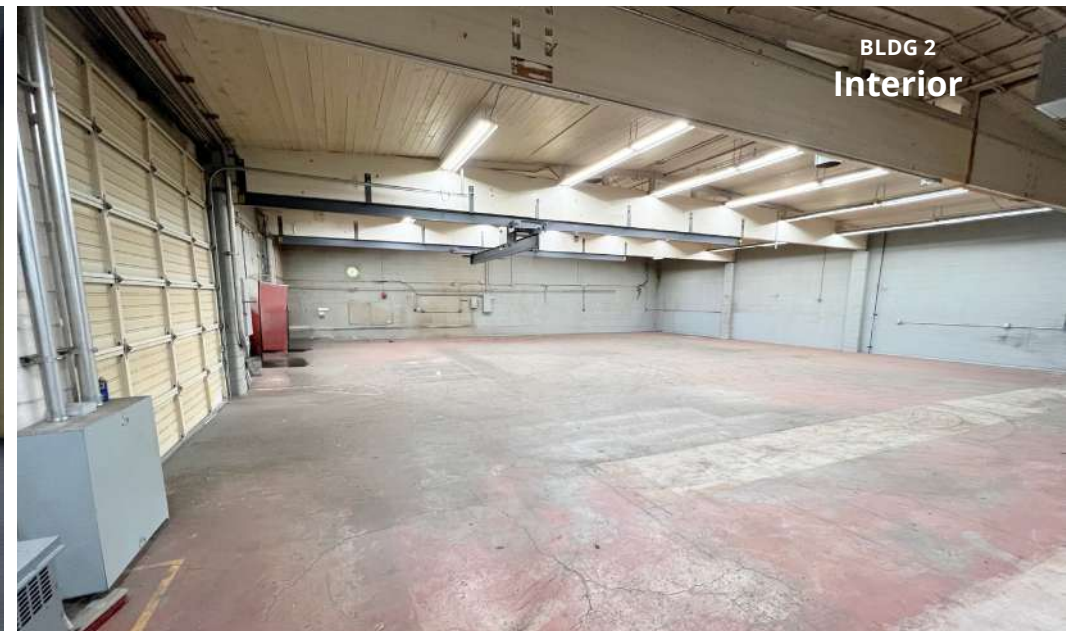
BLDG 2 Interior