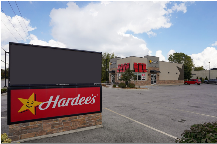
Monument signage facing Maplecrest Road

2720 Maplecrest Road Fort Wayne, IN 46815