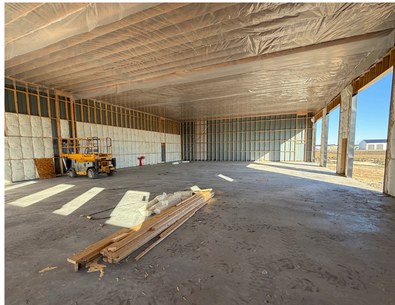
Images are for illustrative purposes only. The building at 34 Gold Sun Drive is proposed and not yet constructed; final design and appearance may vary