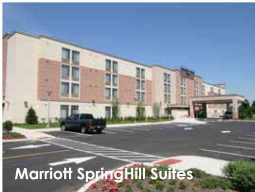
Marriott SpringHill Suites