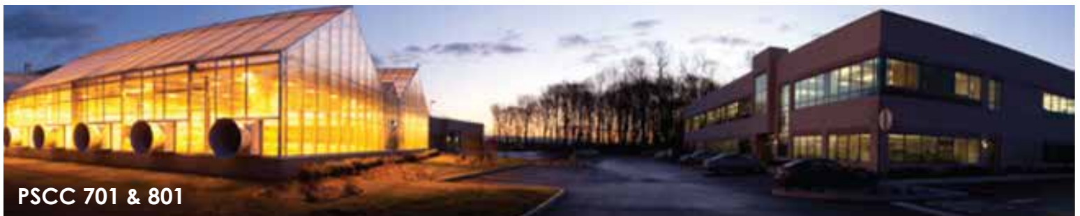
PSCC 701 & 801