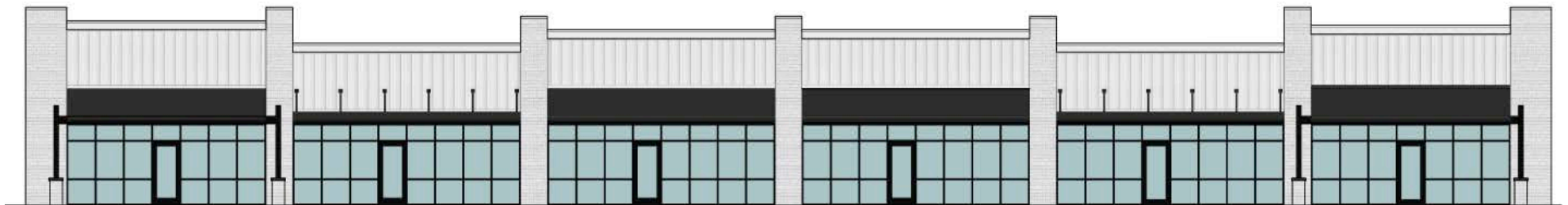
BUILDING 1 FRONT ELEVATION (WEST) N.T.S.