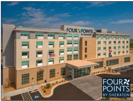
Hotel with 107 Suites