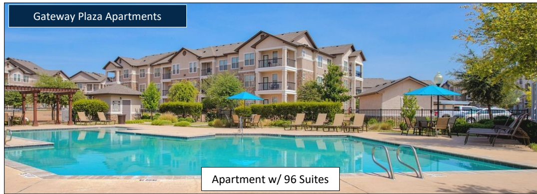
Apartment w/ 96 Suites