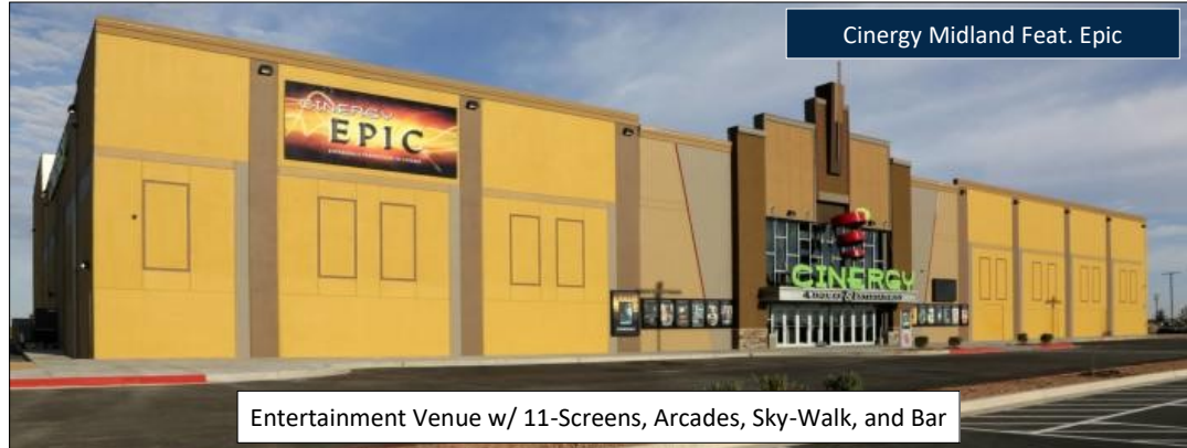
Entertainment Venue w/ 11-Screens, Arcades, Sky-Walk, and Bar