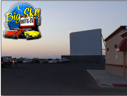
3 Screen Outside Theater with Park & Concessions