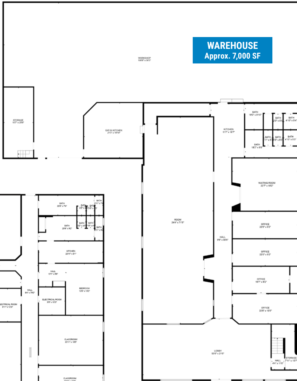
WAREHOUSE Approx. 7,000 SF