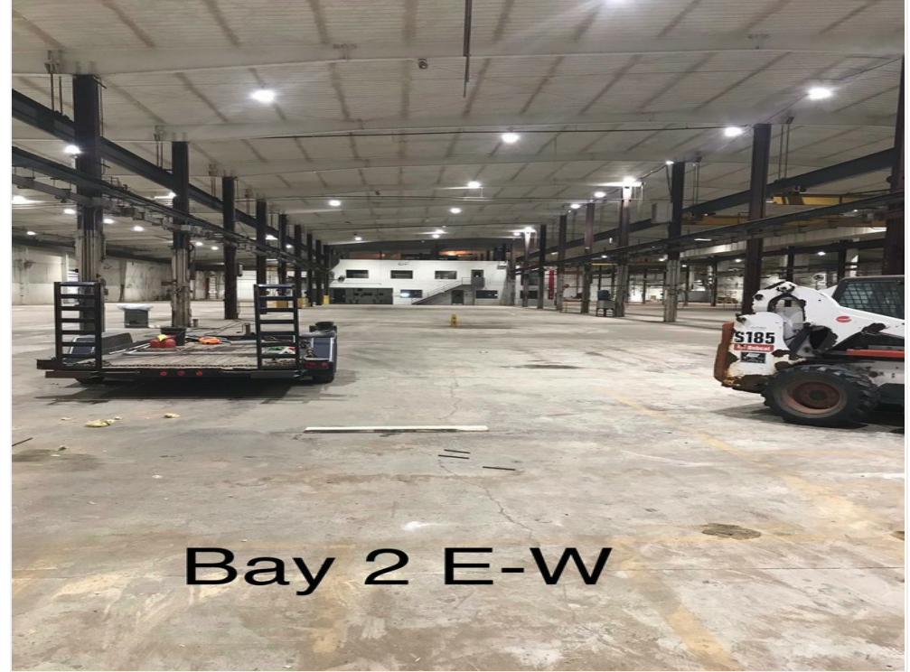
Bay #2 - with Office area