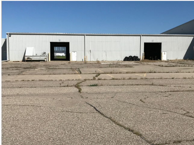
Warehouse Section of Building with 3 drive-in doors and 2 loading docks

3249 S County Road 45, Owatonna, MN 55060