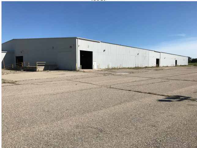
Mfg Section of Bldg - Front view