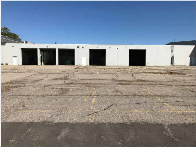
R & D Section of building with 5 drive-in doors and several overhead cranes