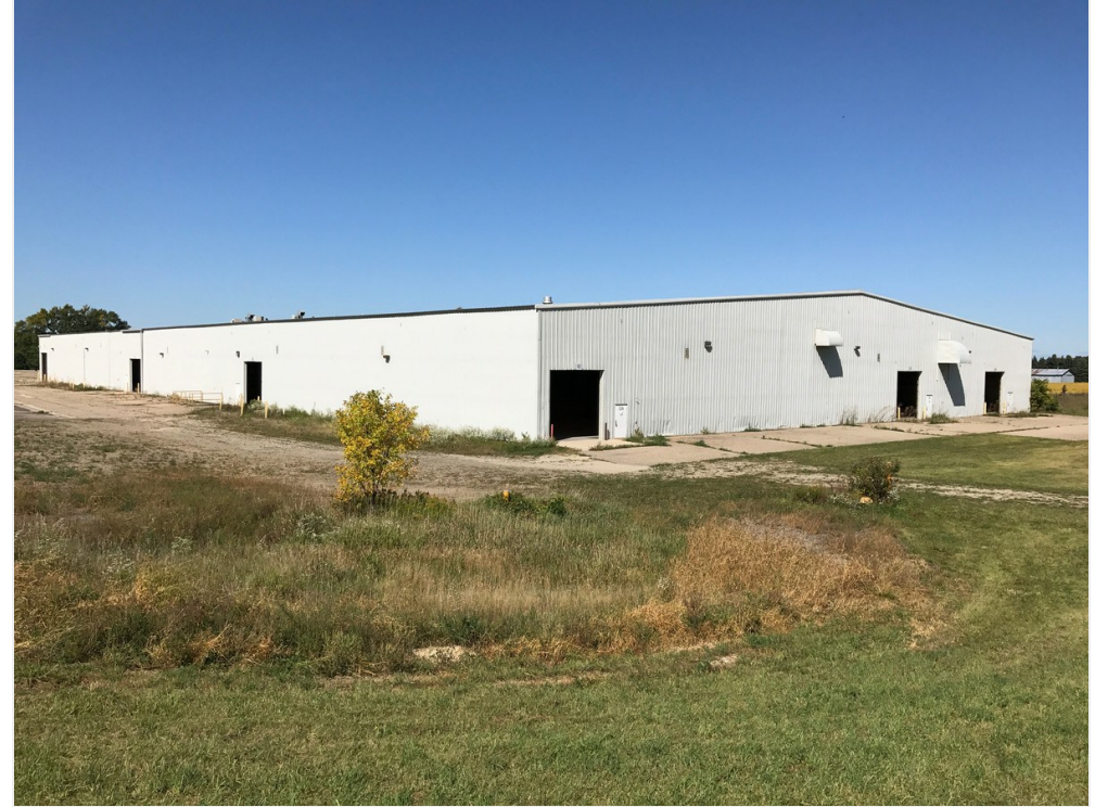
Mfg Section of Bldg - Rear overall view