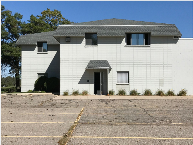
Office Section of Building

3249 S County Road 45, Owatonna, MN 55060