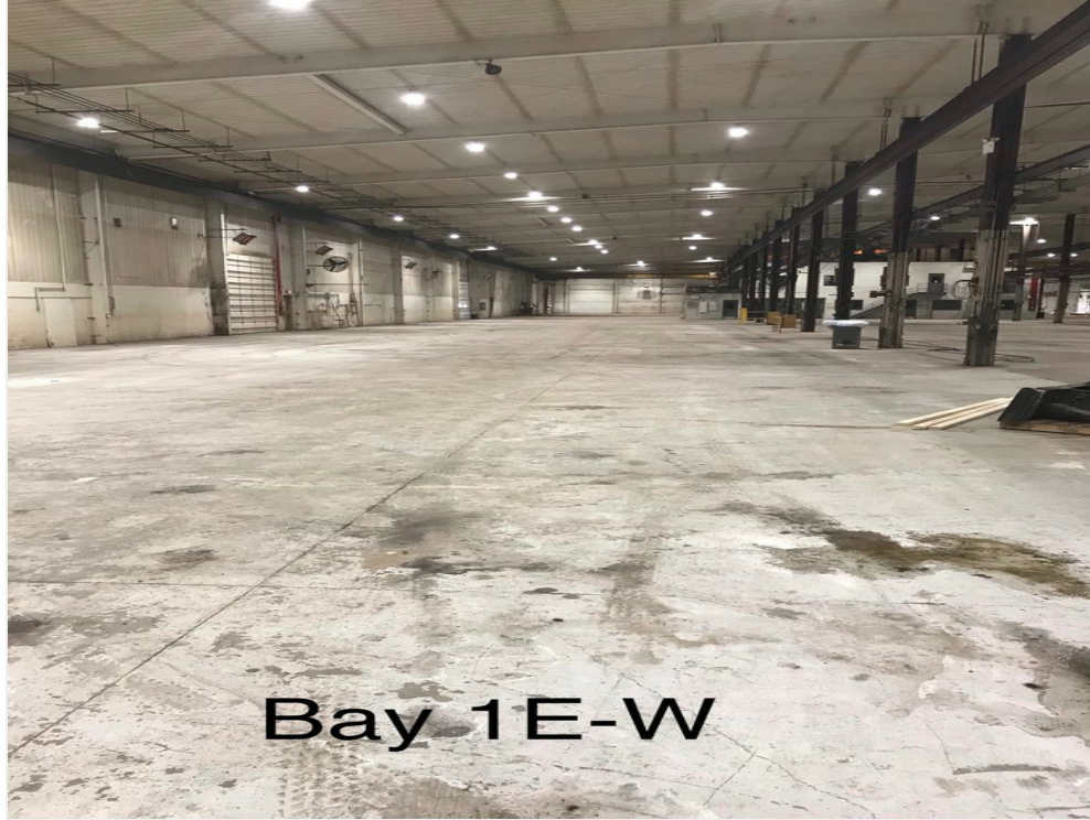
Bay #1 with 5 & 10 Ton Crane