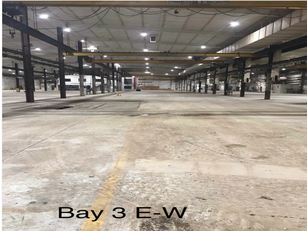
Bay 3 E-W