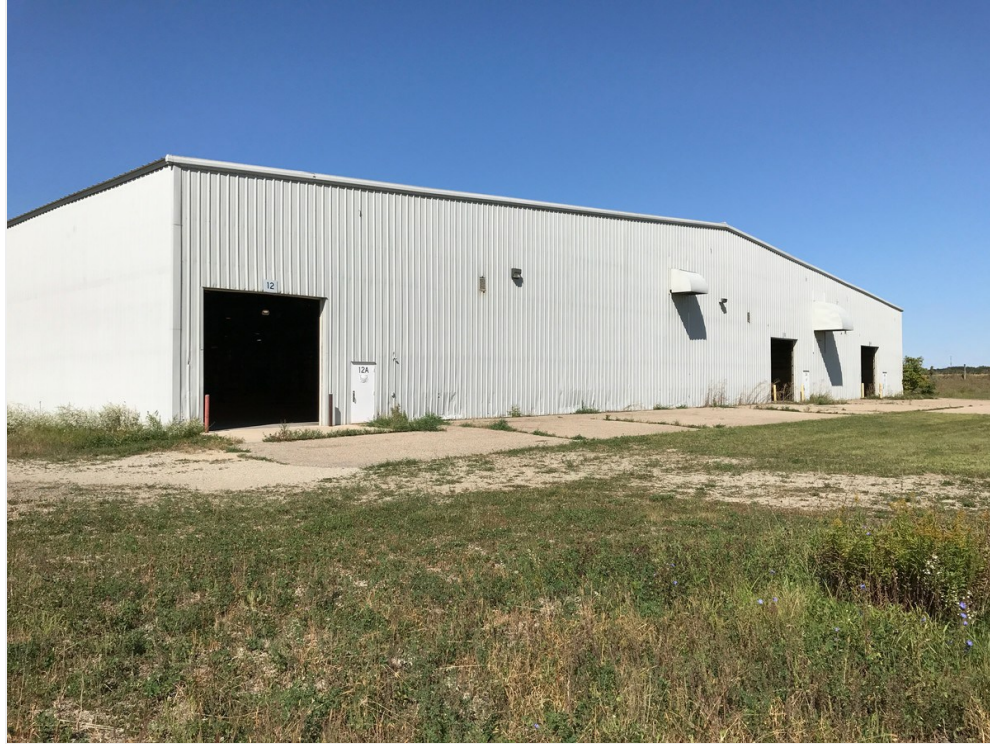
Mfg Section of Bldg - Rear view