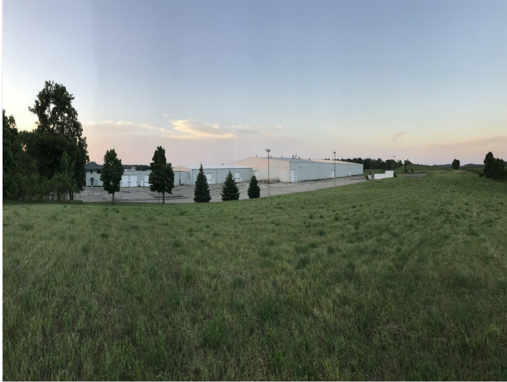
Entire Building with Parking Lot