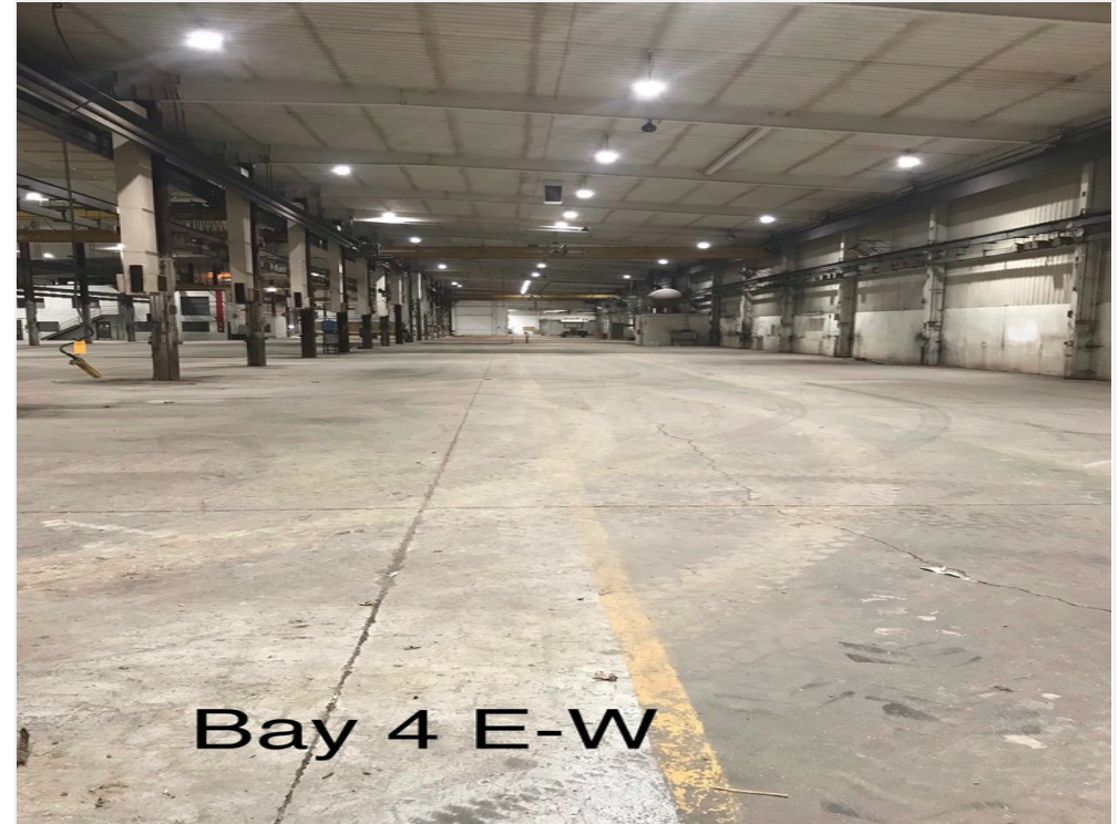
Bay 4 E-W