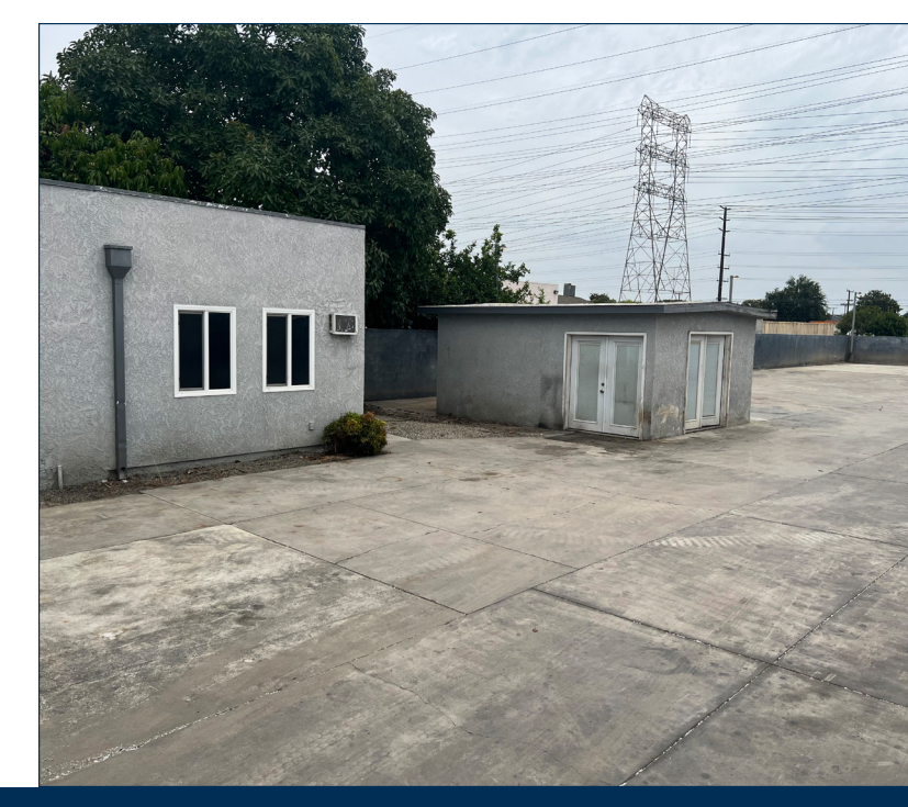
EXCLUSIVELY OFFERED BY: