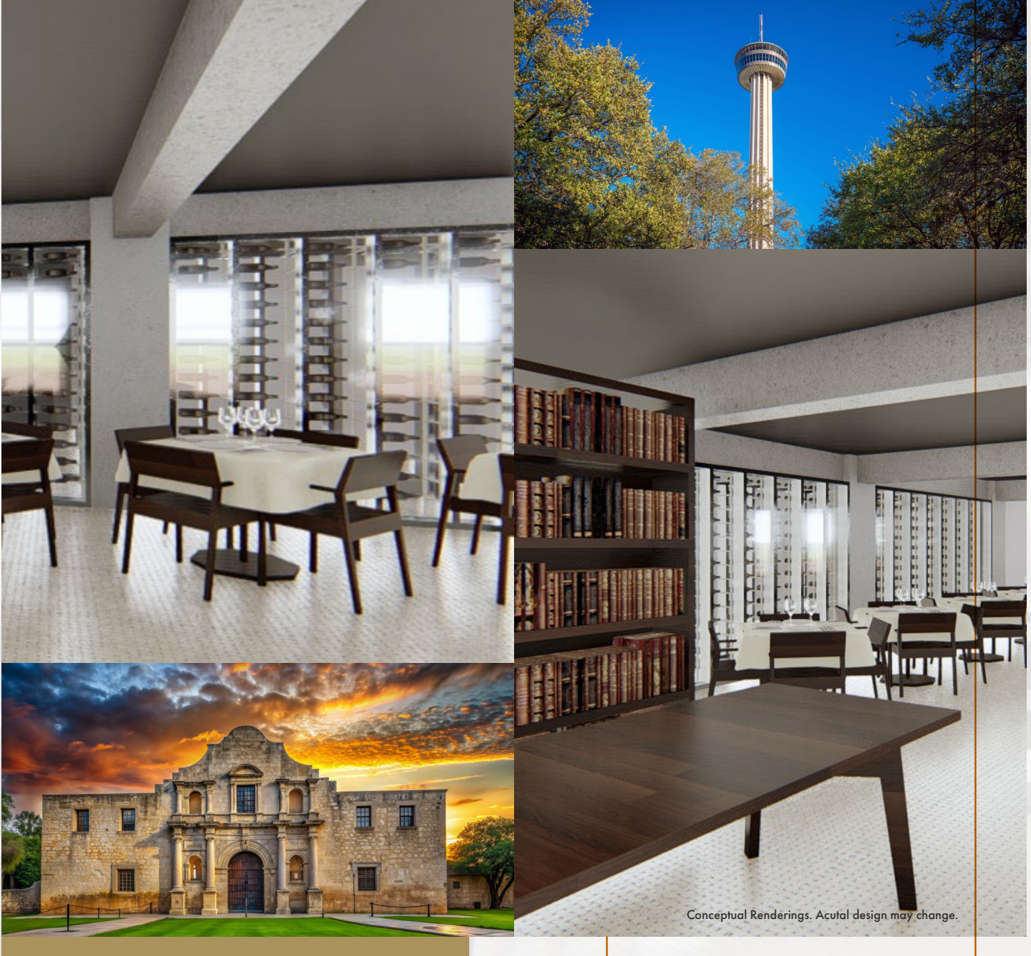
Conceptual Renderings. Actual design may change.