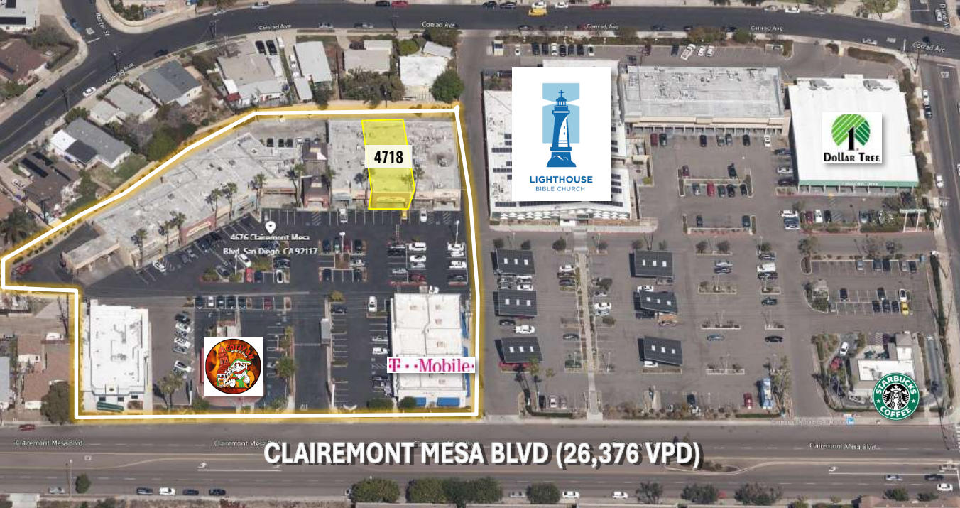
Diane Village Shopping Center