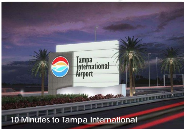
10 Minutes to Tampa International