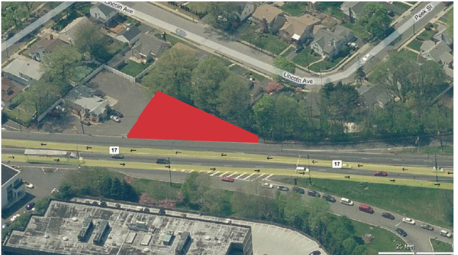
Map & Aerial