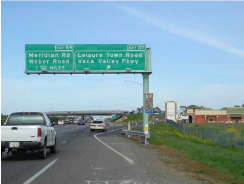
Freeway Exit Sign