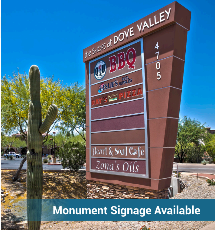
Monument Signage Available