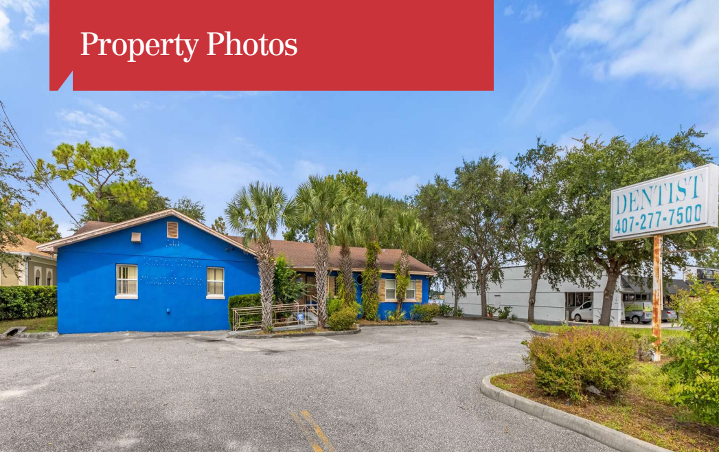
Frontage with Pole Sign