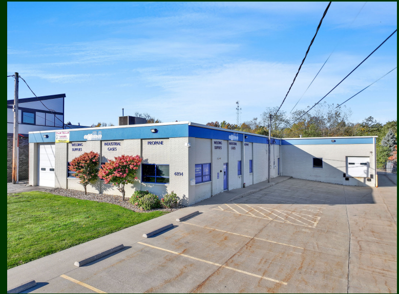
4894 Neo Pkwy, Garfield Heights, OH 44128

No warranty or representation, express or implied, is made as to the accuracy of the information contained herein. It is submitted subject to errors, omissions, price changes, rental or other conditions, withdrawal without notice, and to any special listing conditions imposed by our client.