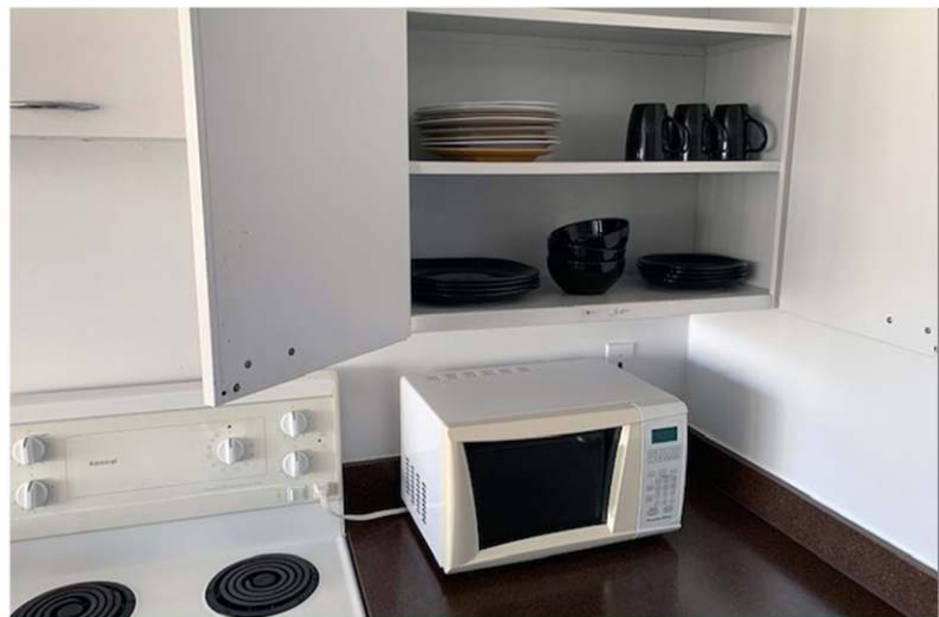
Midtown Apartments - 30 Unit Complex Interior Views