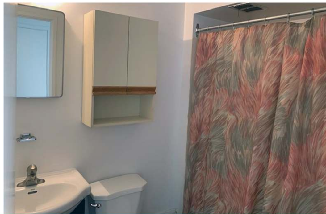
Midtown Apartments - 30 Unit Complex Interior Views