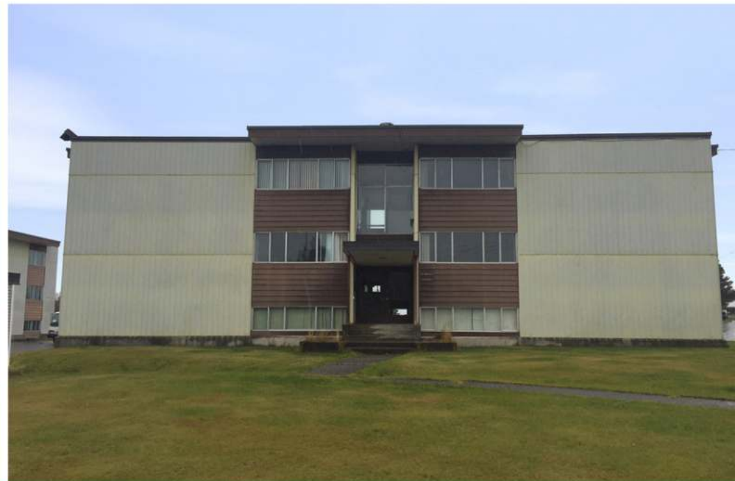
Midtown Apartments - 30 Unit Complex Exterior Views