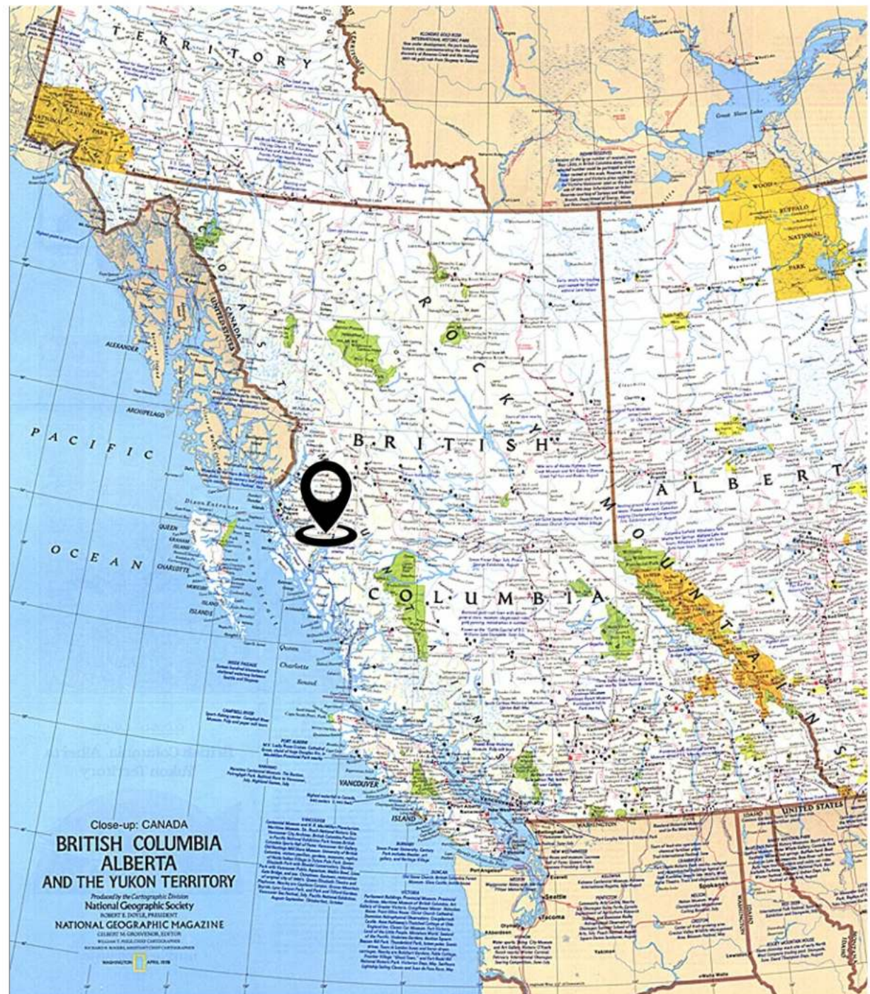
Map of British Columbia, Canada

In addition to its economic impact, LNG Canada has the potential to significantly reduce global greenhouse gas emissions by providing cleaner energy alternatives. This contributes to global efforts to improve air quality and address climate change. Overall, LNG Canada represents a transformative opportunity for Kitimat, driving both economic development and environmental progress.