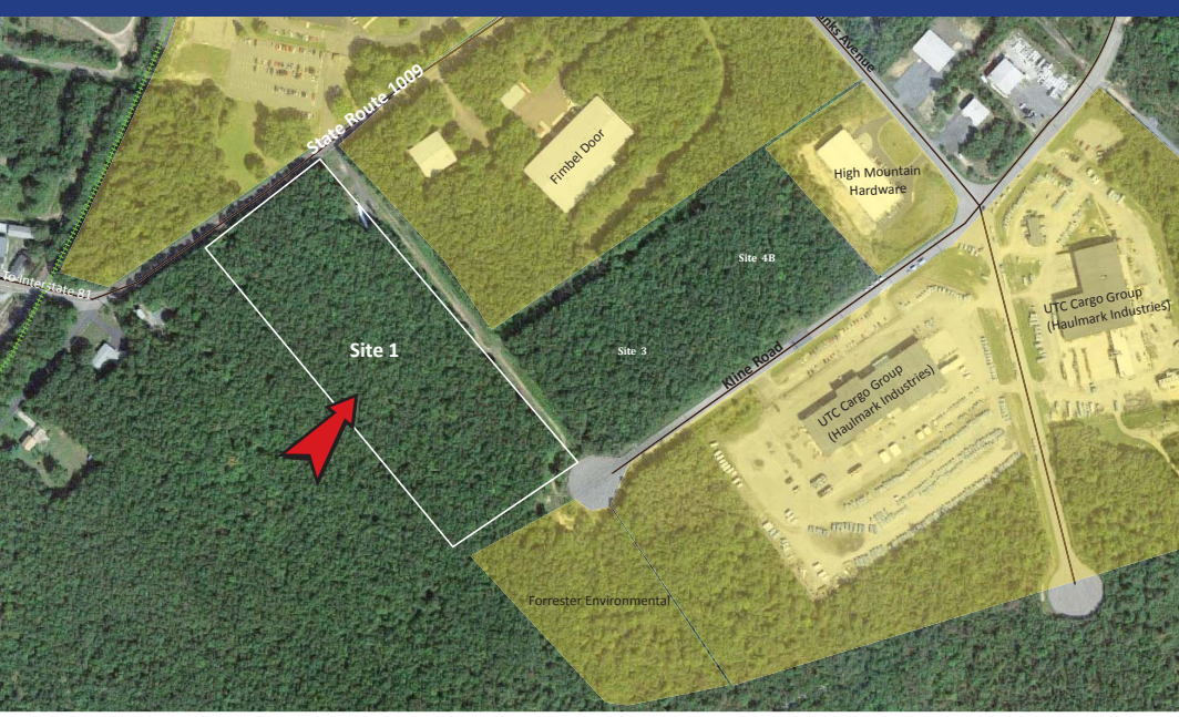
Industrial site suited for Manufacturing / Distribution / Warehouse