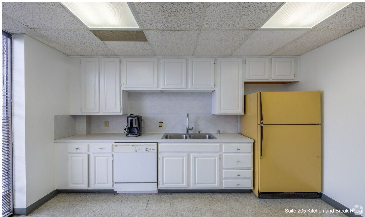
Suite 205 Kitchen and Break Room