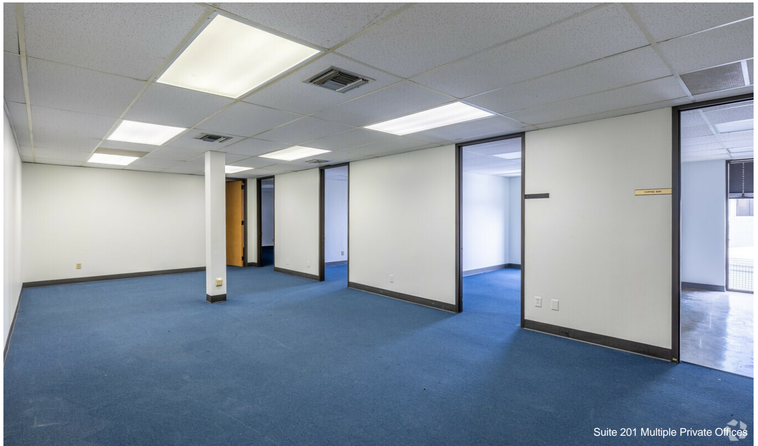
Suite 201 Multiple Private Offices