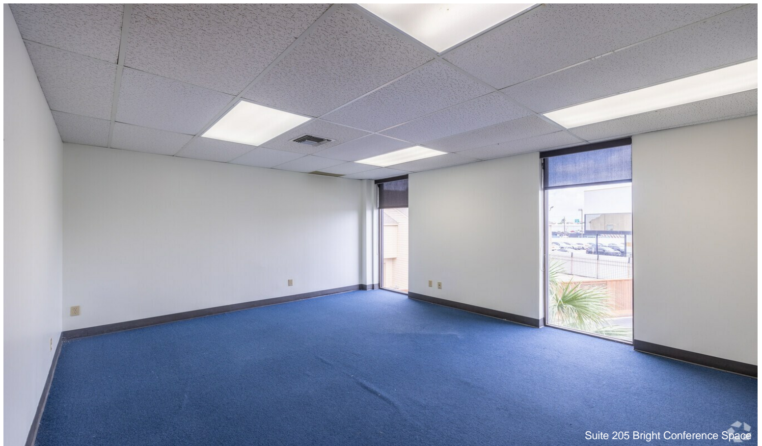
Suite 205 Bright Conference Space