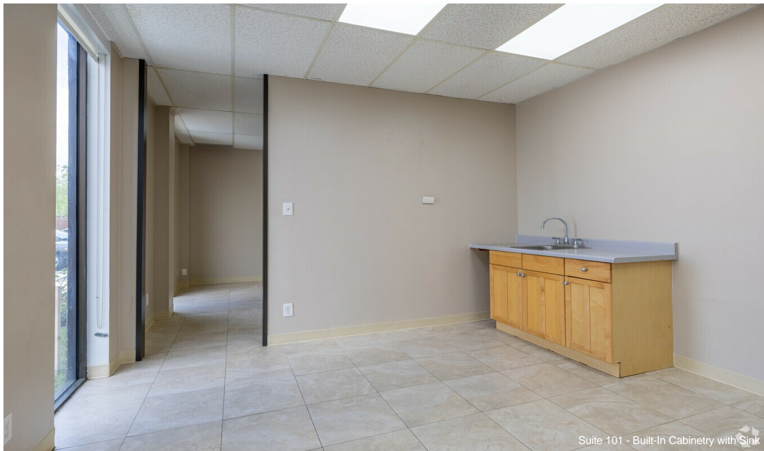
Suite 101 - Built-In Cabinetry with Sink