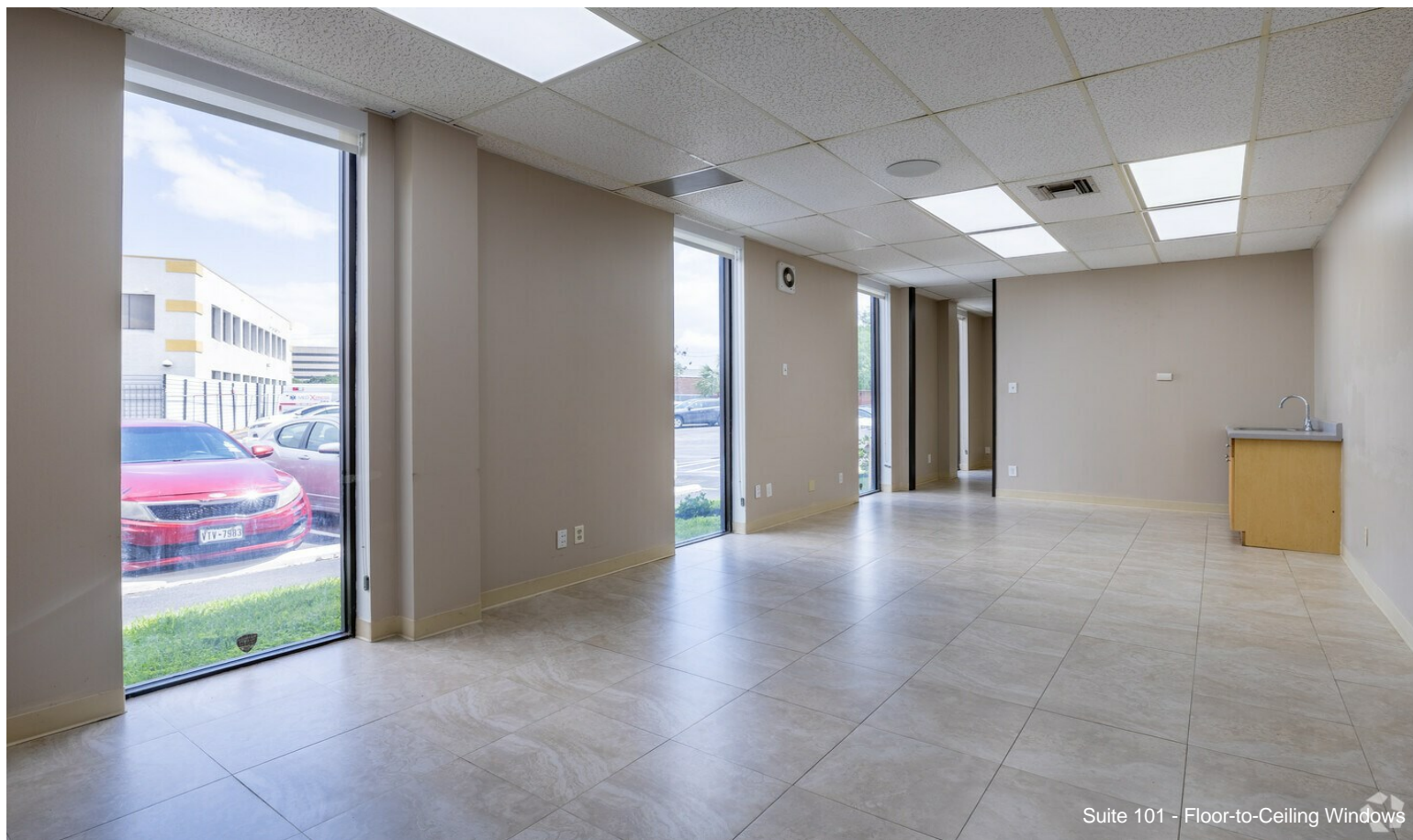
Suite 101 - Floor-to-Ceiling Windows