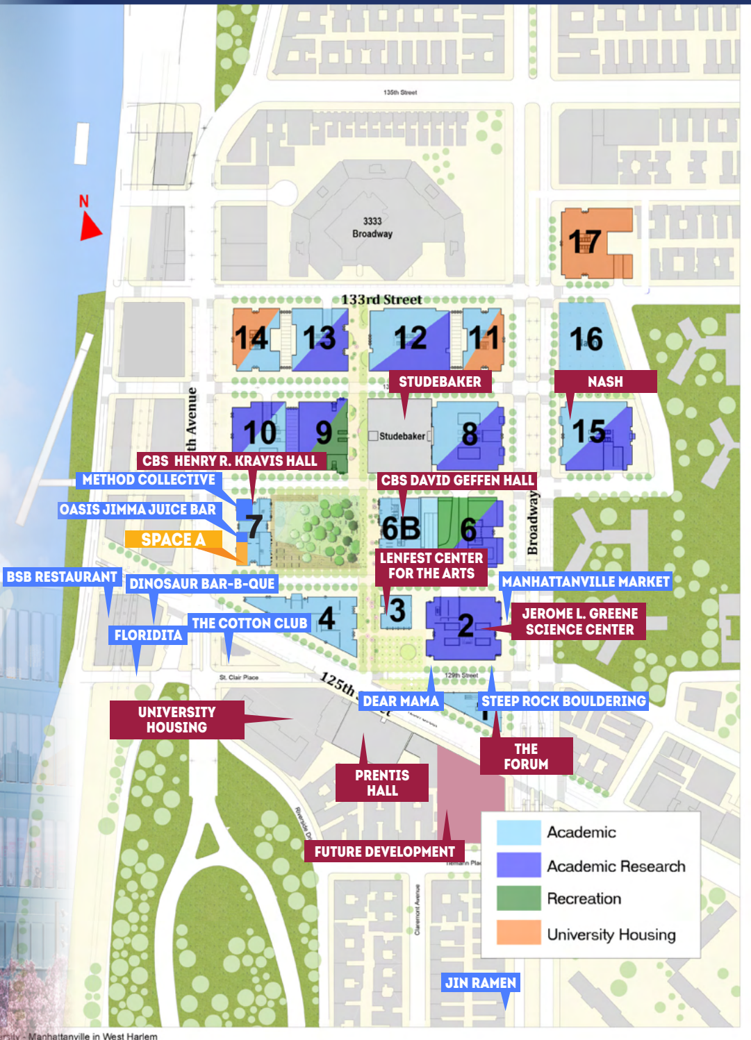
Manhattanville in West Harlem