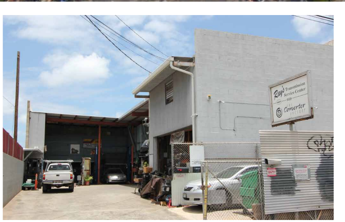
959 QUEEN STREET, HONOLULU, HAWAII 96814