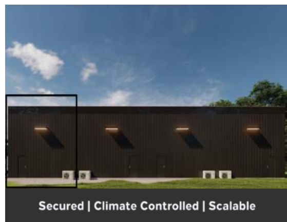
Secured | Climate Controlled | Scalable