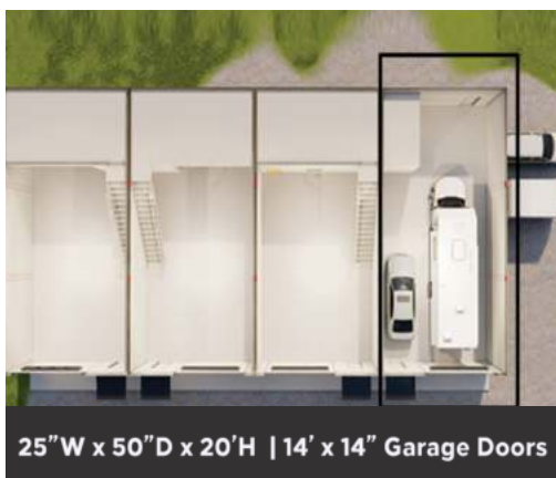
25" W x 50" D x 20' H | 14' x 14" Garage Doors