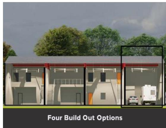
Four Build Out Options