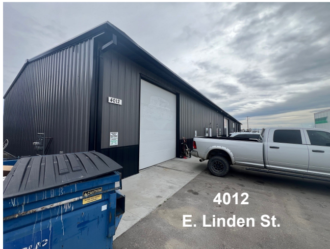
4012 E. Linden St.