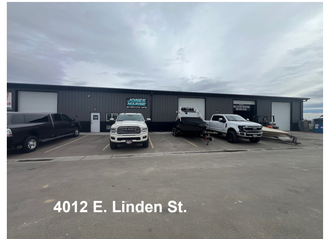
4012 E. Linden St.