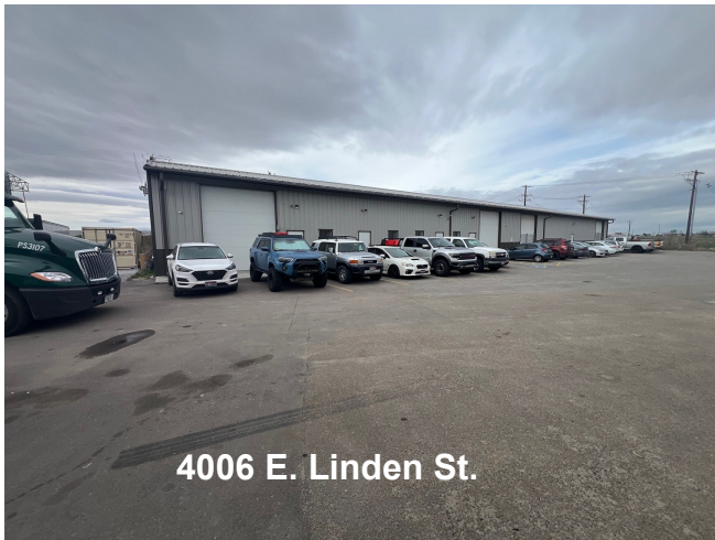
4006 E. Linden St.