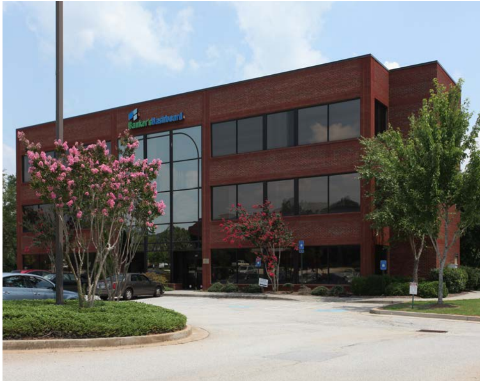
825 Fairways Court | Stockbridge, GA 30281