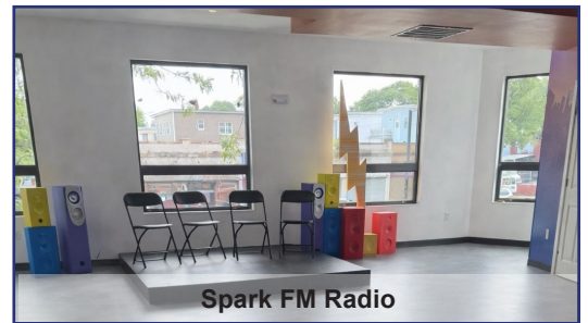
Spark FM Radio

This is an ideal acquisition for an investor seeking a stabilized, income-producing asset in Boston. The property is priced appropriately for current market conditions, offering both cash flow and long-term appreciation potential.