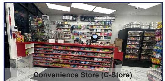
Convenience Store (C-Store)

JEFF SIMILIEN | JEFF@DMGBROKERAGE.COM | O: 781.591.3232 X705 83 MORSE STREET, BUILDING #6 | NORWOOD, MA 02062 | 781.591.3232 WWW.DMGBROKERAGE.COM