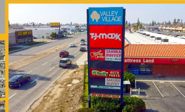
Valley Village Shopping Center

Valley Village Shopping Center - Bakersfield, CA