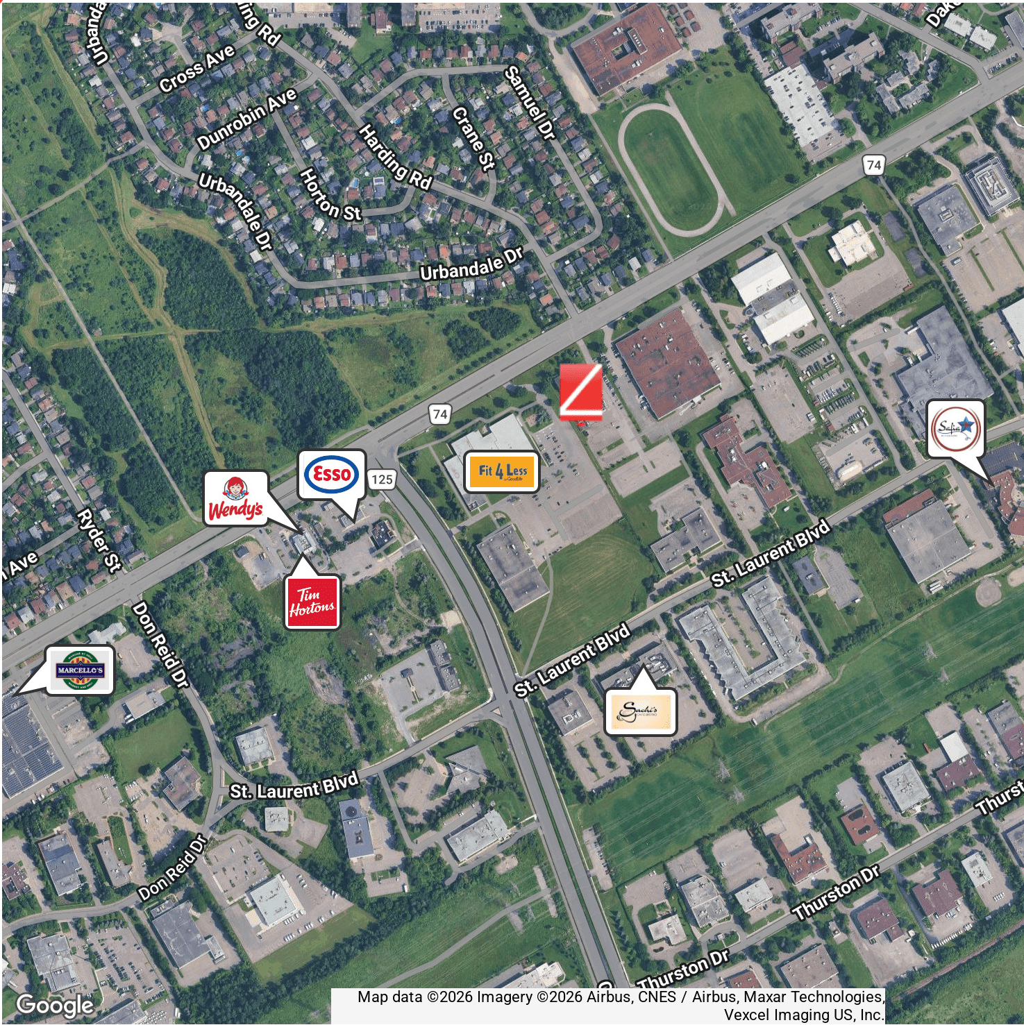
Map data ©2026 Imagery ©2026 Airbus, CNES / Airbus, Maxar Technologies, Vexcel Imaging US, Inc.