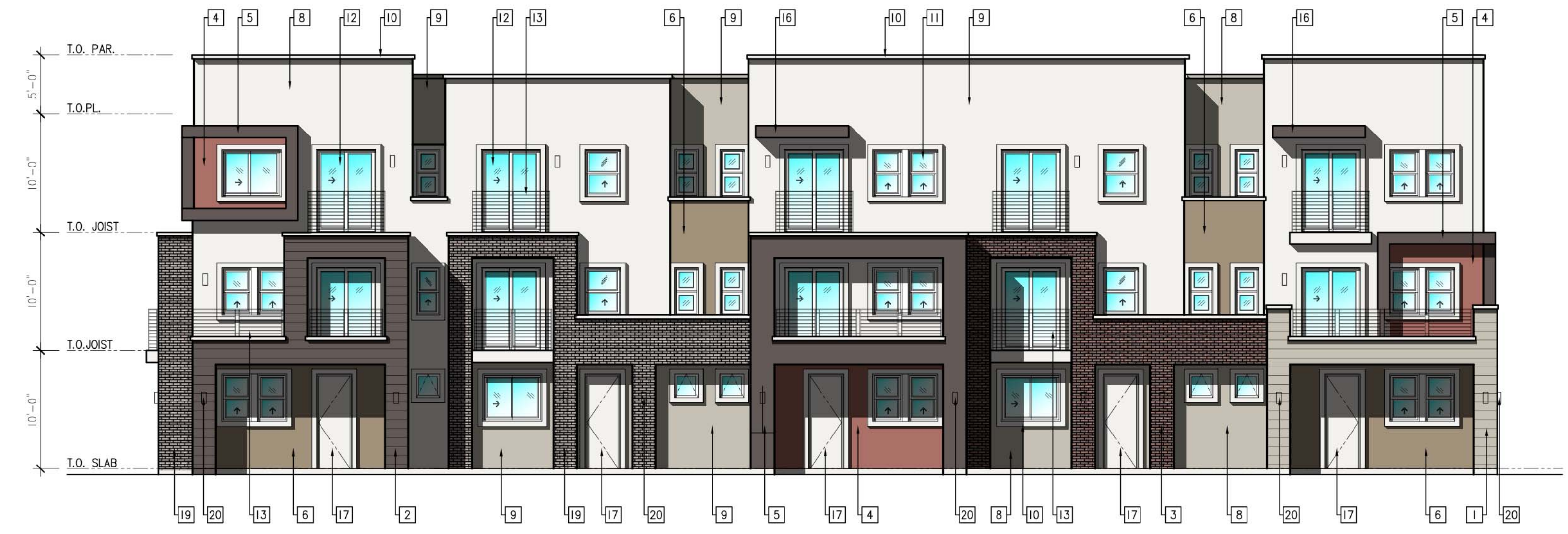
4 Elevation D