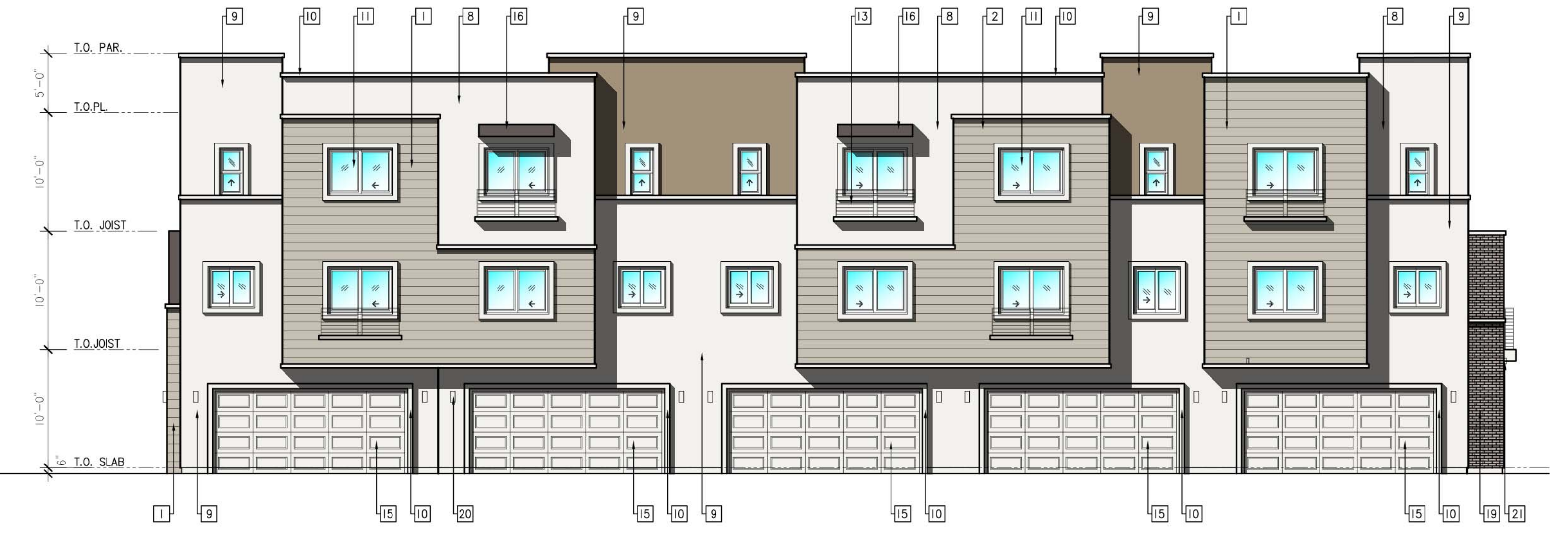
2 Elevation B