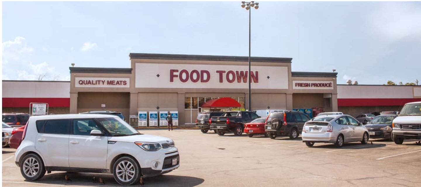
Channelview Grocery Store