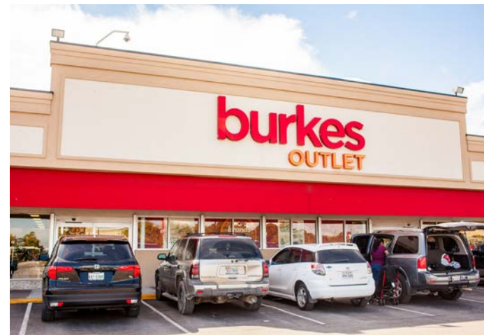
Recently Completed New Fascia

2010 Census, 2018 Estimates with Delivery Statistics as of 09/18