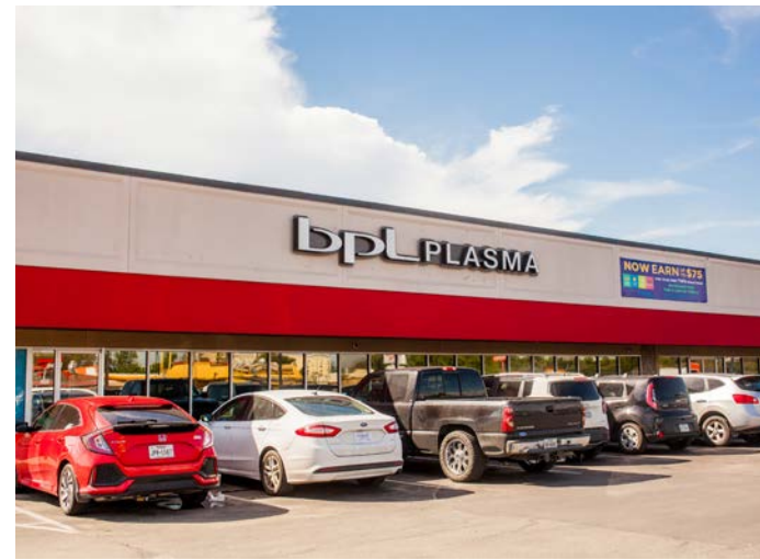
Junior Box Available