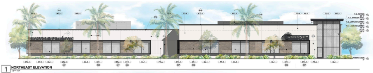
1 NORTHEAST ELEVATION 1/8" = 1'-0"