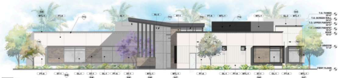
2 SOUTHEAST ELEVATION 1/8" = 1'-0"