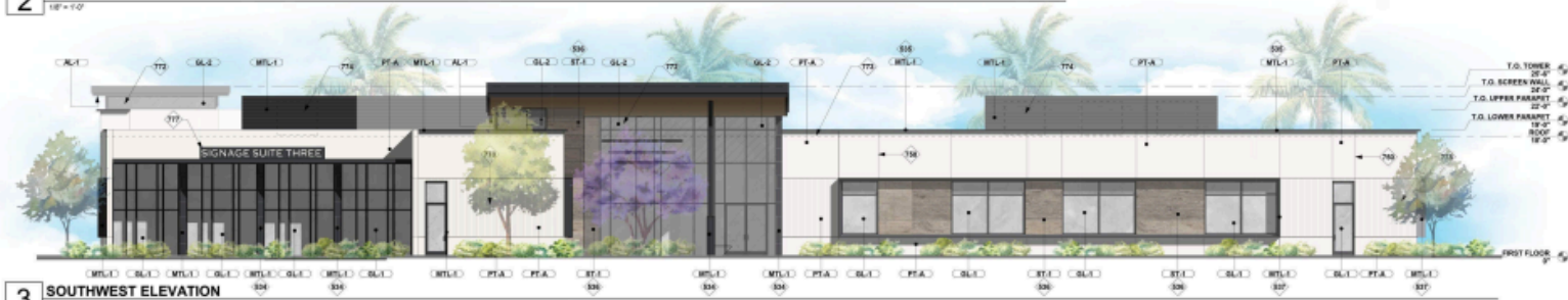
3 SOUTHWEST ELEVATION 1/8" = 1'-0"