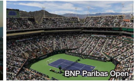
BNP Paribas Open