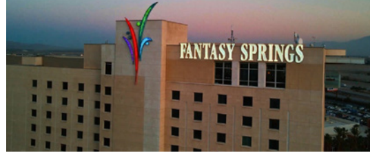
Fantasy Springs Resort Casino

The Coachella Valley is also one of North America's premier golf destinations with more than 100 courses attracting seasonal visitors and high-income households throughout the winter and spring months. Notable championship destinations include PGA West in nearby La Quinta, host of the annual American Express PGA TOUR tournament, along with Indian Wells Golf Resort and SilverRock Resort. Positioned along Interstate 10, the primary east-west corridor connecting the Coachella Valley to the Inland Empire and greater Southern California, the subject location benefits from strong regional accessibility and placement within one of the valley's primary retail corridors serving the growing eastern Coachella Valley trade area.