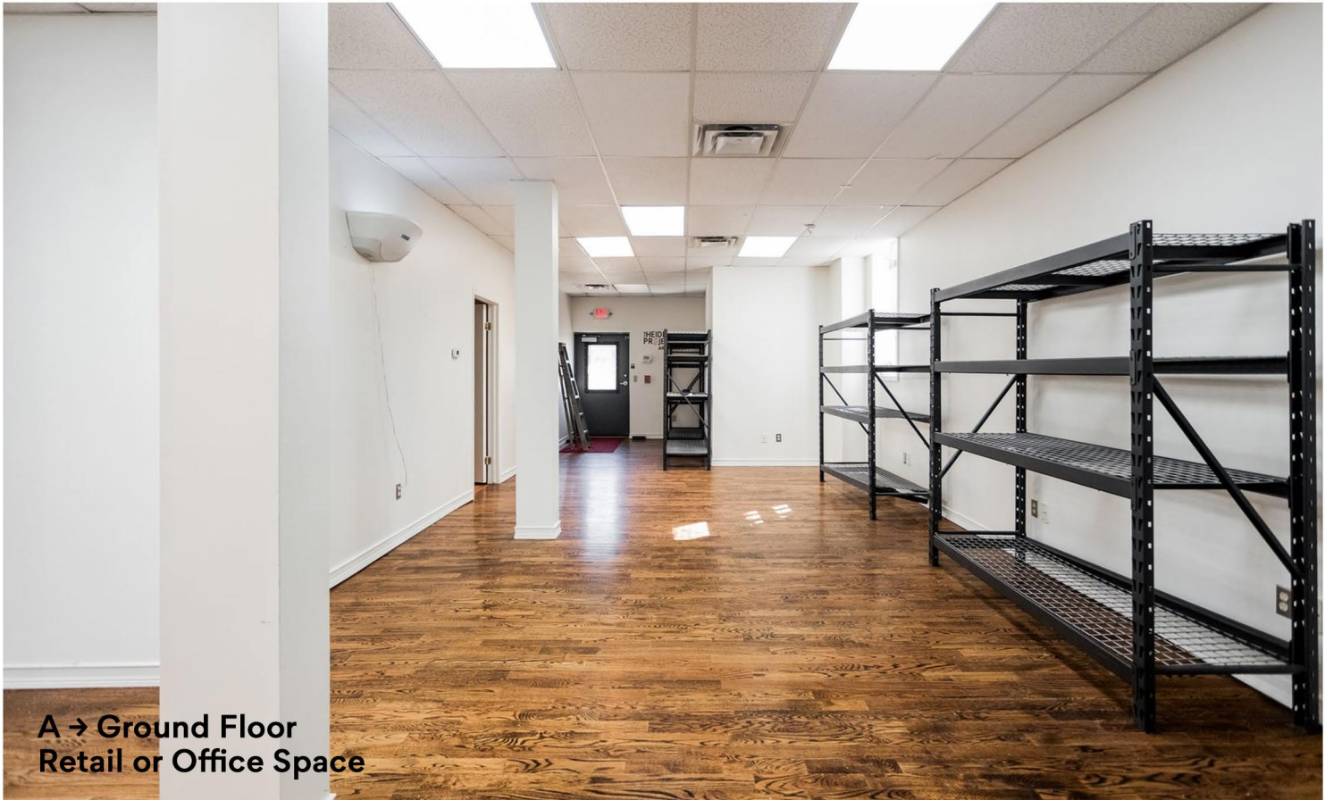
A → Ground Floor Retail or Office Space