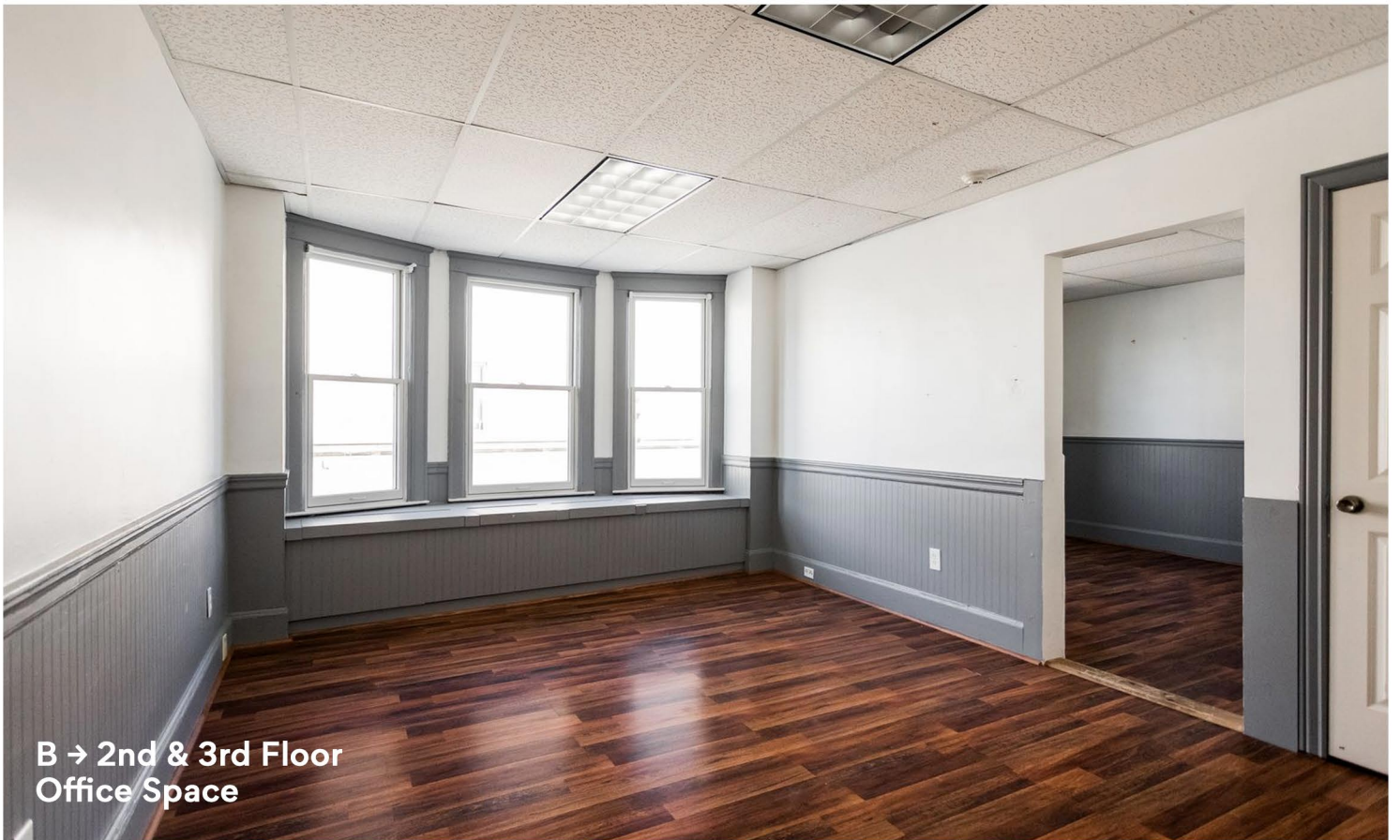
B → 2nd & 3rd Floor Office Space